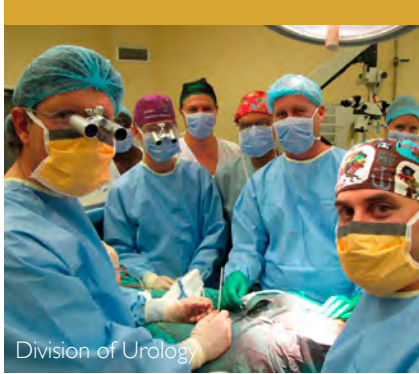
Division of Urology