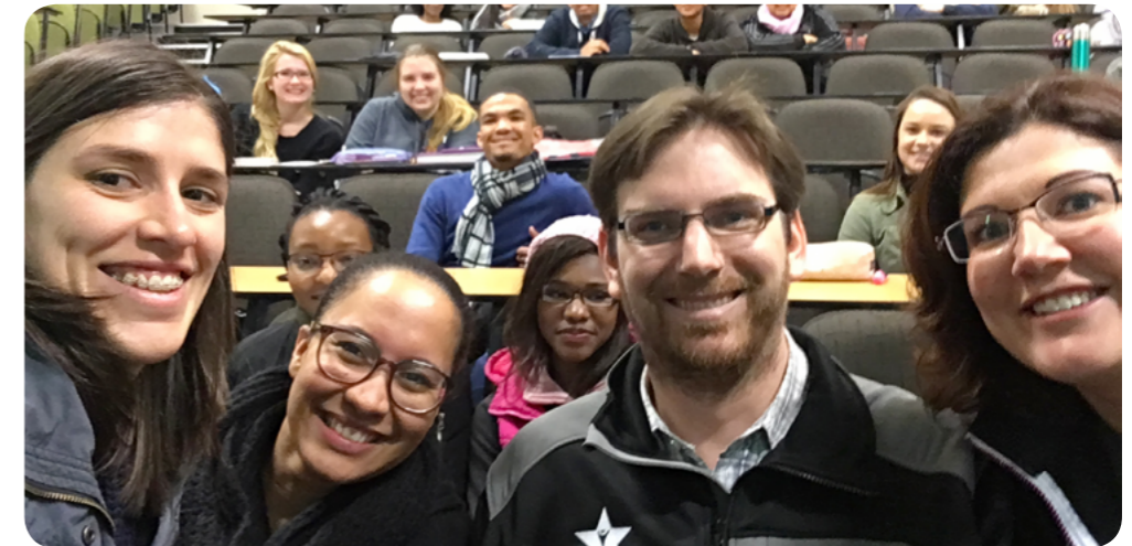
Figure 2: Lecturers taking selfie to post onto the Facebook group at the launch event

Launch event: The assignment was introduced in the same way as a commercial marketing launch event with a product launch and fanfare.