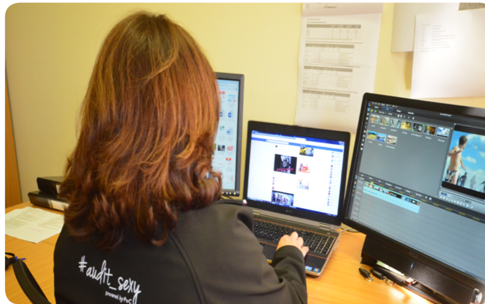
Figure 4: Lecturer monitoring the Facebook group