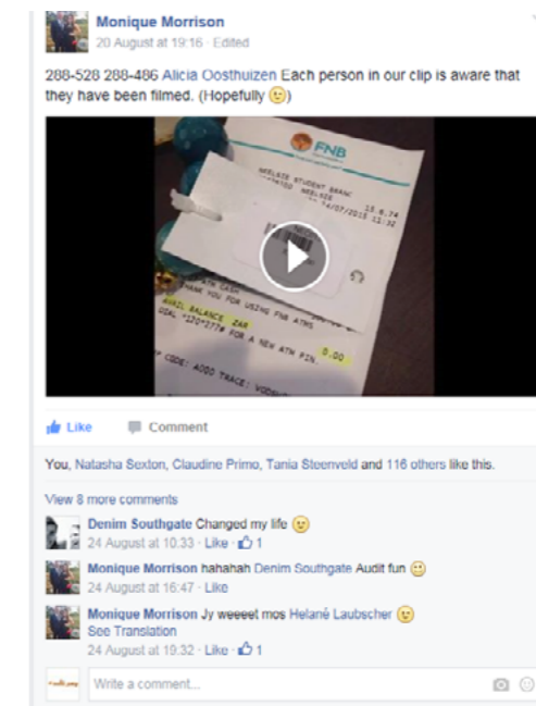
Figure 2: Winning video submission

The winning photo identified the risk of parking documents blowing away in the wind in a parking lot and the risk of not every driver receiving a receipt when paying for parking. This could result in the theft of cash by the parking attendant when not issuing receipts or when receipts are lost. It was recommended that the attendant sit in a booth and issue each driver with a receipt upon leaving the parking lot.