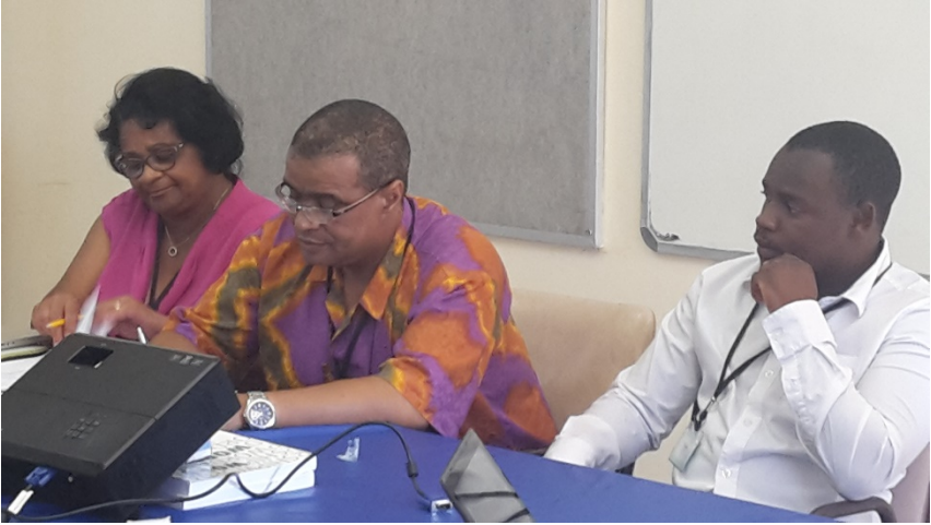
The panel discussion in George (Lofdal URC Church)