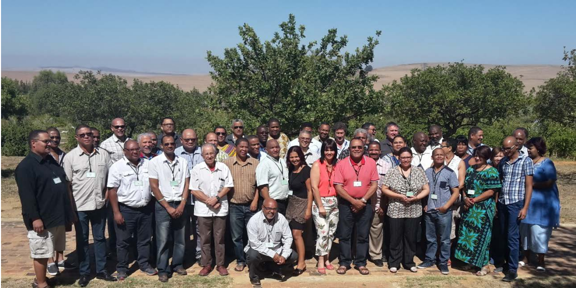
Delegates at Goedgedacht Farm, Malmesbury