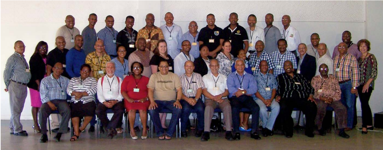
Eastern Cape SKLAS at The Willows, Port Elizabeth