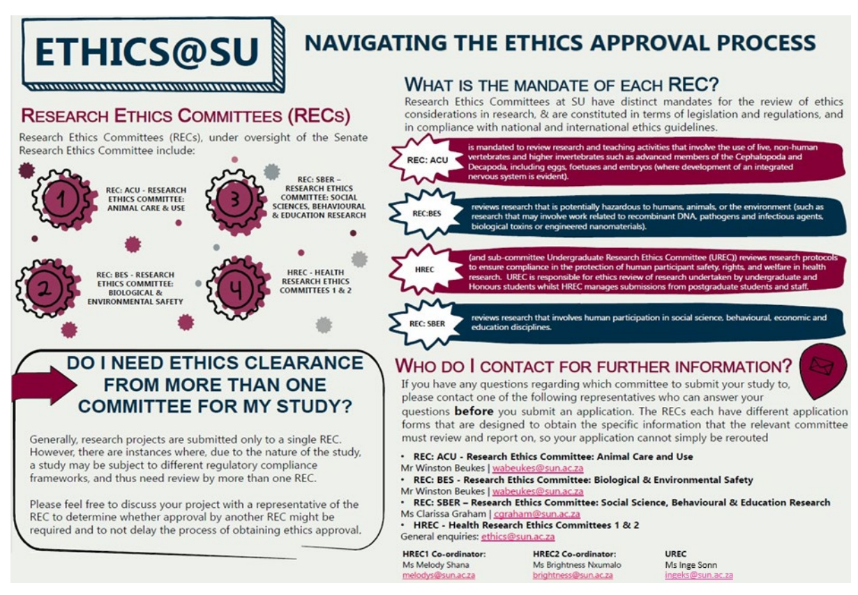
Infographic adapted from http://www.sun.ac.za/english/research-innovation/Research-Development/integrity-ethics

Following successful completion of the PhD proposal review process (see 1.2, above) by the review panel, candidates should allow up to three months for the separate ethics process of a doctoral study, from application to outcome. Ethics approval for an individual study, OR - in cases where a parent study covers the PhD study - a letter adding a student as investigator to an existing, ethics-approved study, is accepted for the purpose of Senate admission. In case of the latter, the original or most recent ethics approval of the larger study should also be submitted to the Tygerberg Doctoral Office (tyg-phd@sun.ac.za). Note that ethics approval for a parent study does not automatically cover all objectives of a PhD study. In the case of complex project structures, students or their supervisors are invited to contact the REC representatives for advice individually before submitting an application to the REC.