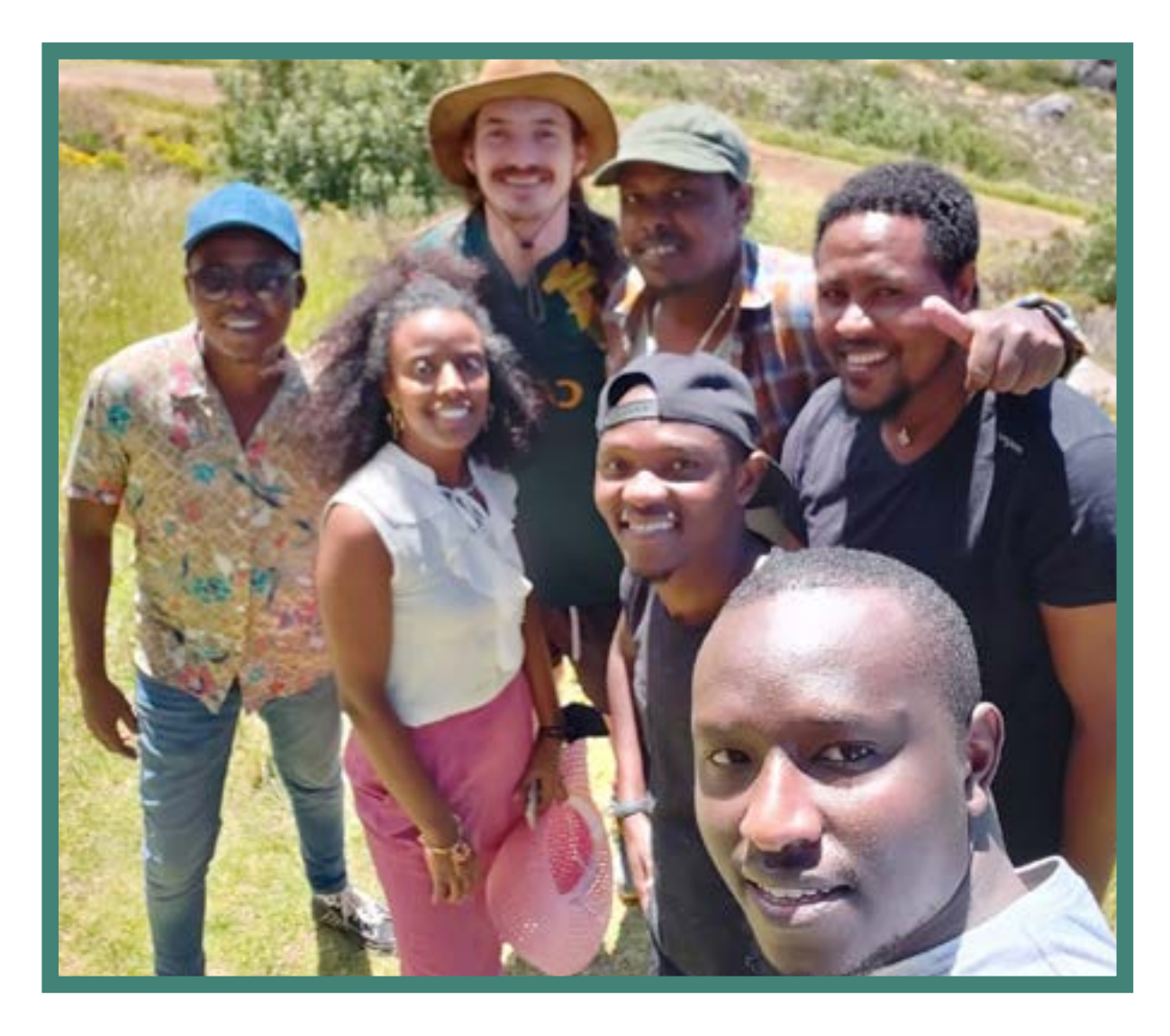
getting to know each other outside of class