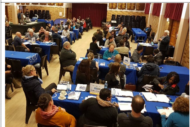
Stellenbosch judges getting ready to do their crucially important job!