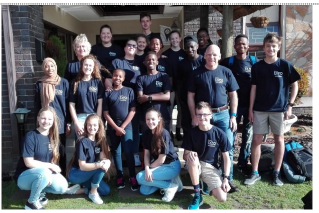
The Stellenbosch ISF group on an excursion to Koeberg power station and Cape Town Heart museum.