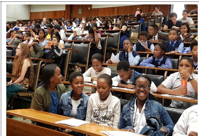
Learners at a workshop, all ready to start their research projects.