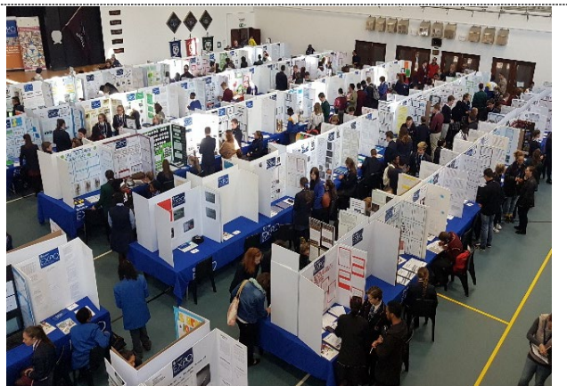
It's regional expo time and projects have been set up. Anticipation prevails ...