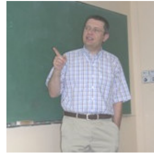
Prof Johnny Fontaine

" The five promises of the componential emotion approach ". Prof Fontaine is 'n deskundige op die gebied van kultuur en emosies.