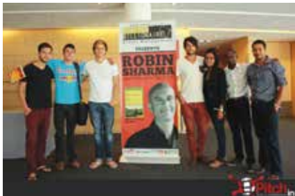
PitchIN acquired 16 sponsored tickets for students to attend a Conference of Robin Sharma, a leadership expert