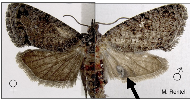
FCM adult wings. Female on left (no scent organ on hind wing); male on right (scent organ on hind wing - androchonia).