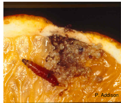
FCM feeding in citrus.