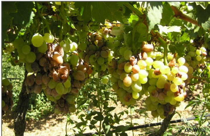
FCM feeding damage to grape bunches.

In addition to controlled releases of egg parasitoids, the CrleGV virus is commercially available as an IPM-compatible means of combatting FCM. Mating disruption, sterile insect technique and attract and kill techniques which utilize the pheromone together with an insecticide, are also IPM appropriate control measures. A large variety of chemicals are registered for use against FCM but should be used sparingly in order to preserve natural enemy populations.