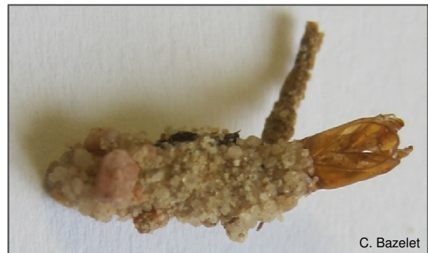
FCM pupal skin emerging from soil cocoon after adult emergence.