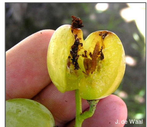
FCM feeding in grape.