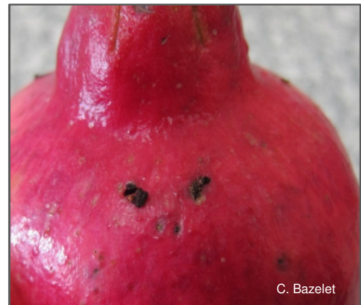
FCM damage to pomegranate.