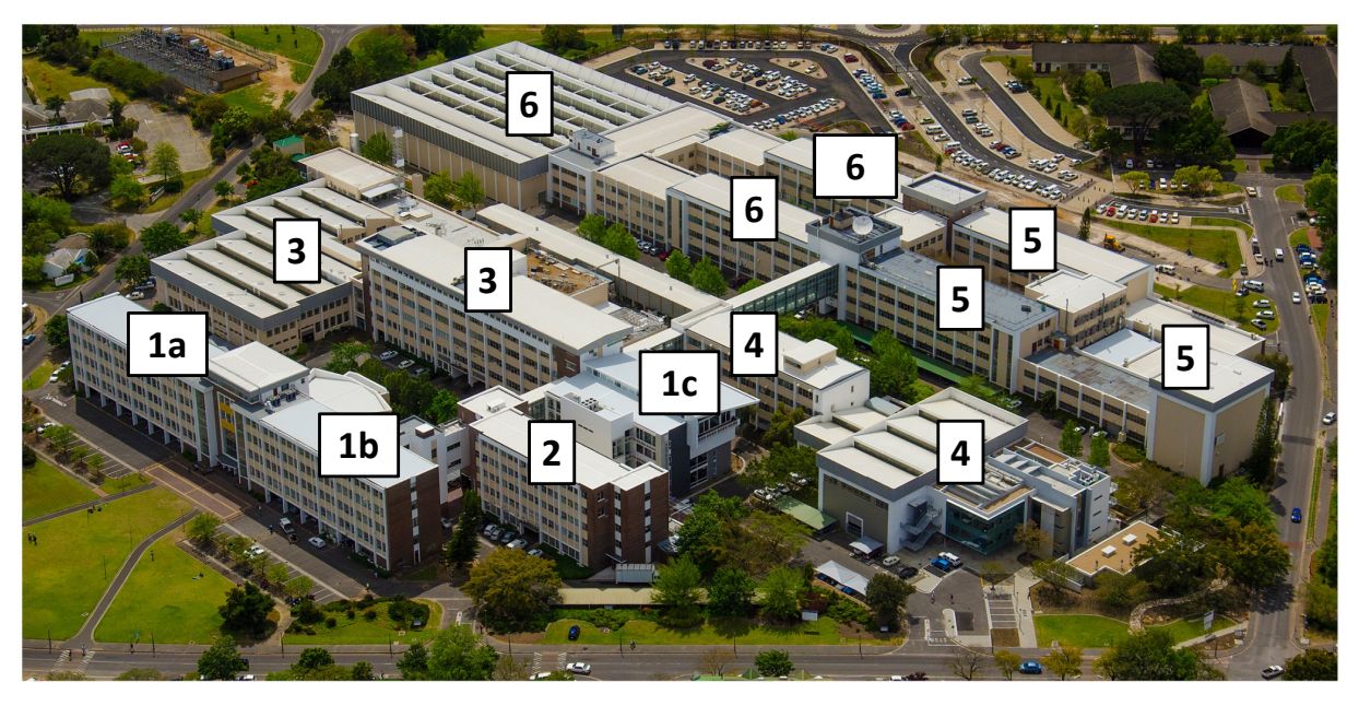
Figure 1.1: The building complex of the Faculty of Engineering (the numbers are used in the descriptions below).

The current building complex in Banghoek Road, Stellenbosch, was completed in the seventies and since then it has been expanded from time to time; for example, when the Knowledge Centre was added in 2012. The figure below shows an aerial photograph of the buildingcomplex.