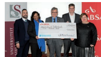
Top: A thumbs up for partnering for access: Absa and SU representatives celebrate a collaborative achievement for undergraduate bursary support

He added that "if it weren't for donations such as the one we have