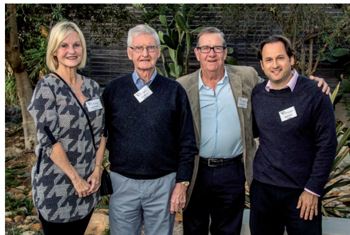
Top: Investing in knowledge creation: The 2017 Harry Crossley postgraduate cohort at SU.

Similarly, the students who have benefitted from bursary support have an equal responsibility to carry on the legacy and vision of their benefactors and 'pay it forward' when they are in a position to do so one day. ►