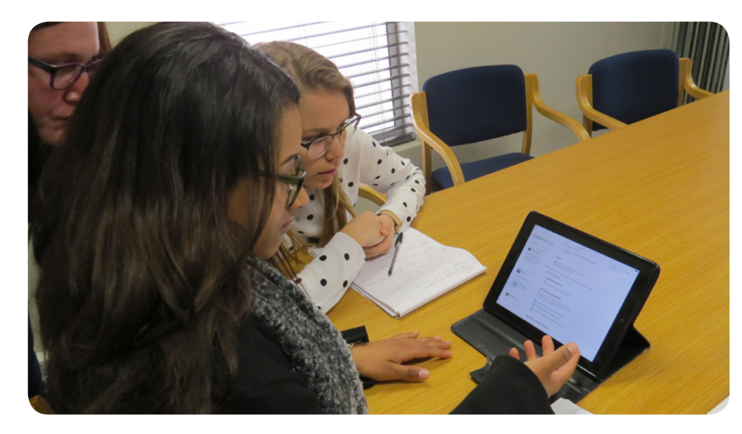
Figure 2: Students develop short questionnaires

During the third phase, the students evaluated the psychometric properties of the questionnaires. All the students submitted their questionnaires and completed the questionnaires created by the other groups. This resulted in a data set for each group. The lecturers made podcasts available on SUNLearn that showed the students how to evaluate the data: how to use Microsoft Excel formulas, clean data sheets and run the equations taught in class to calculate the reliability and validity of the results. The students completed this phase in groups.