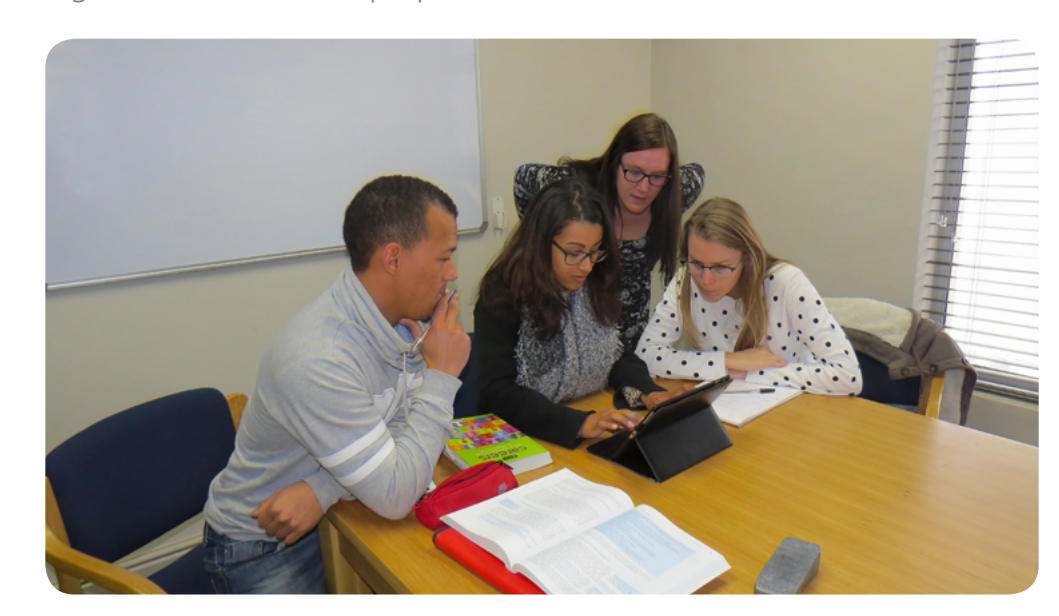
Figure 1: Students working in groups

During the first phase, the students theorised in terms of academic performance. This meant that they read up on issues that influence academic performance, identifying three factors and writing a brief paragraph in which they argued how the literature supported these. They then shared their findings with their group members in the following contact sessions. The group members discussed the findings and argued which factor was most significant and relevant. Using their conclusions, the groups then put together small research proposals.