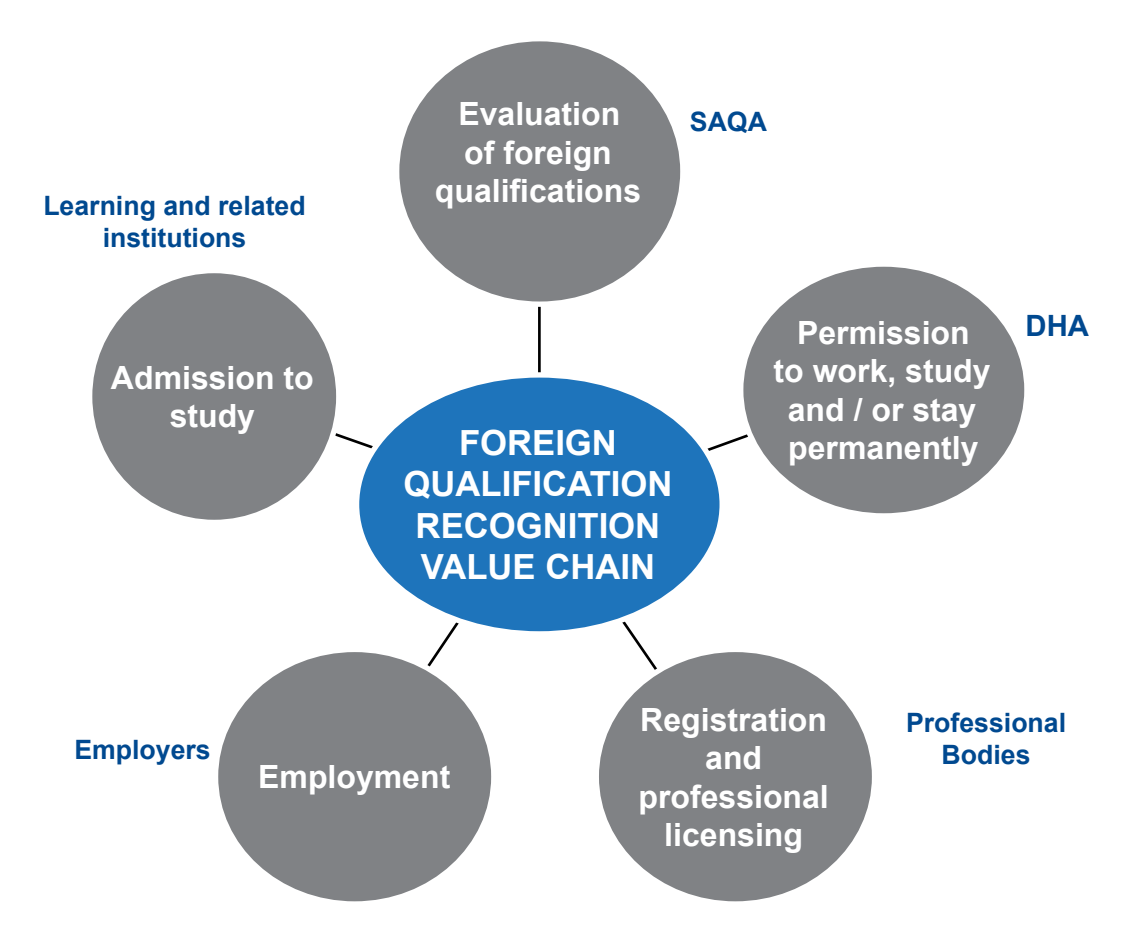
Figure 2: The Recognition Value Chain for foreign qualifications