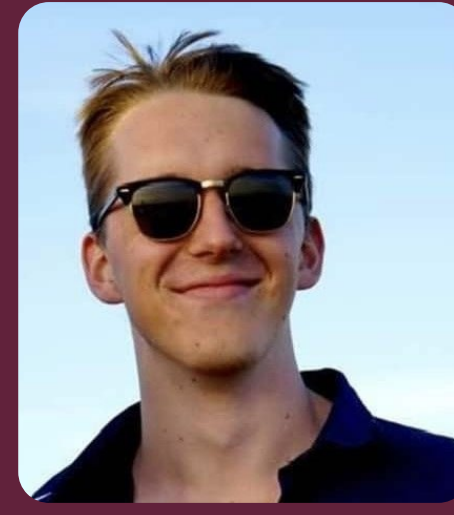
Carl van Rooyen Engineering