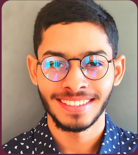
Mogammad Sauls Engineering