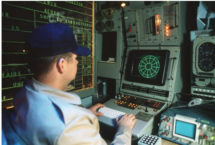
"Slick 32" screen on USS Iowa , 1984

Overall, SEWIP is a $5.297 billion program, with spending ramping up sharply as of FY 2014. Though SLQ-32 is a Raytheon system, SEWIP began in 2003 with General Dynamics as the lead integrator. Blocks 1A, 1B2, and 1B3 all use the improved control and display (ICAD) console, which is a GD-AIS upgrade based on the