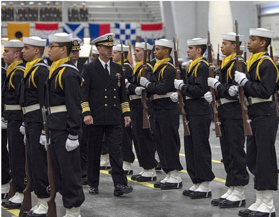
GREAT LAKES, Ill. (Jan. 25, 2019) Chief of Naval Operations Adm. John Richardson reviews the recruit ceremonial honor guard during a pass-in-review graduation ceremony at Recruit Training Command (RTC). Richardson served as the reviewing officer for the ceremony. The CNO is visiting RTC, the Navy’s only boot camp, to observe changes in training that are improving basic warfighting skills and toughness in the Navy’s newest Sailors. More than 30,000 recruits graduate annually from the Navy’s only boot camp.