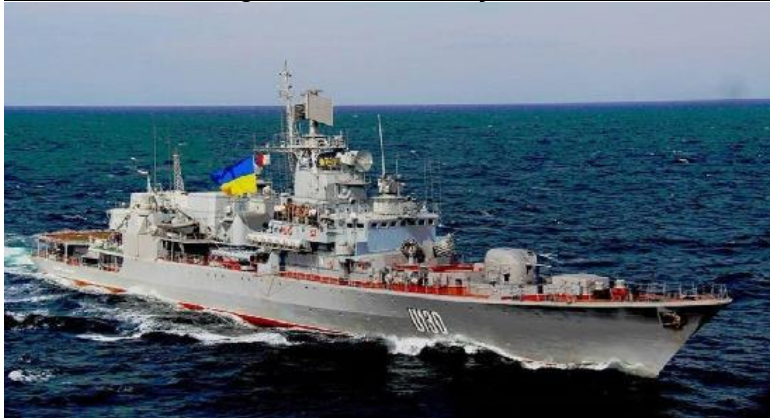
The 3 000 ton Ukrainian Navy frigate Hetman Sahaydachniy . Photo: MoD of Ukraine