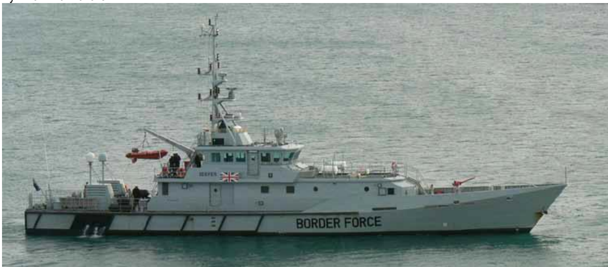
The Border Force Unit HMC Seeker in the port of Portland

The UK Border Force is risking collisions in the Channel, say experts, as it is claimed their vessels are acting in an "unseaman-like" manner by turning off tracking systems. Merchant shipping operating on autopilot in one of the world's busiest shipping lanes often rely on the location devices as their "only means of anti-collision". The Border Force cutters operating off the Kent coast have potentially risked collision by failing to use the internationally-recognised Automatic Identification System (AIS), which alerts fellow seafarers and coastal authorities of their location, route and other safety-related information to aid safe passage at sea. Tom Sharpe, a former Royal Navy officer and Captain of HMS Endurance , said: "Operating without AIS is pretty dodgy. It's not very clever and it's not very seaman-like." "The problem is that in a busy shipping area like the Dover Strait there are a number of vessels going through who are not paying attention and AIS is their only means of anti-collision." "The merchant vessel on autopilot may not be maintaining a proper lookout, so AIS is the thing that saves your bacon because it pings on the anti-collision systems. "I personally wouldn't go to sea in any boat no matter