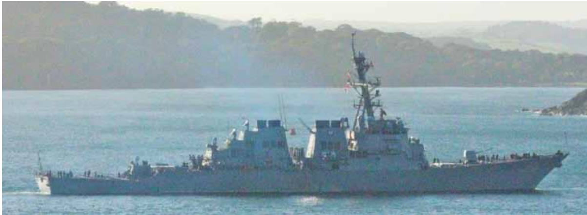
The US Navy Arleigh Burke class guided missile destroyer USS Porter has left homeport of Rota in Spain for combined operations with the Turkish navy and airforce in the Eastern Mediterranean.