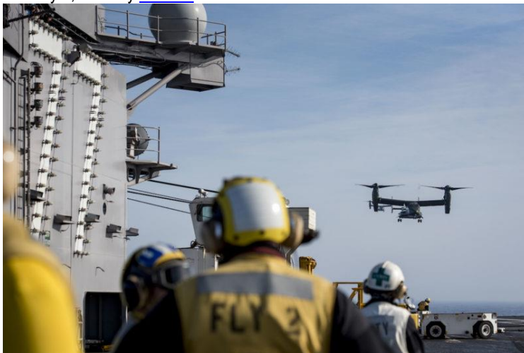
An MV-22 Osprey prepares to land on the flight deck of the aircraft carrier USS George H.W. Bush (CVN 77) during flight operations in the Atlantic Ocean, Dec. 3, 2018.