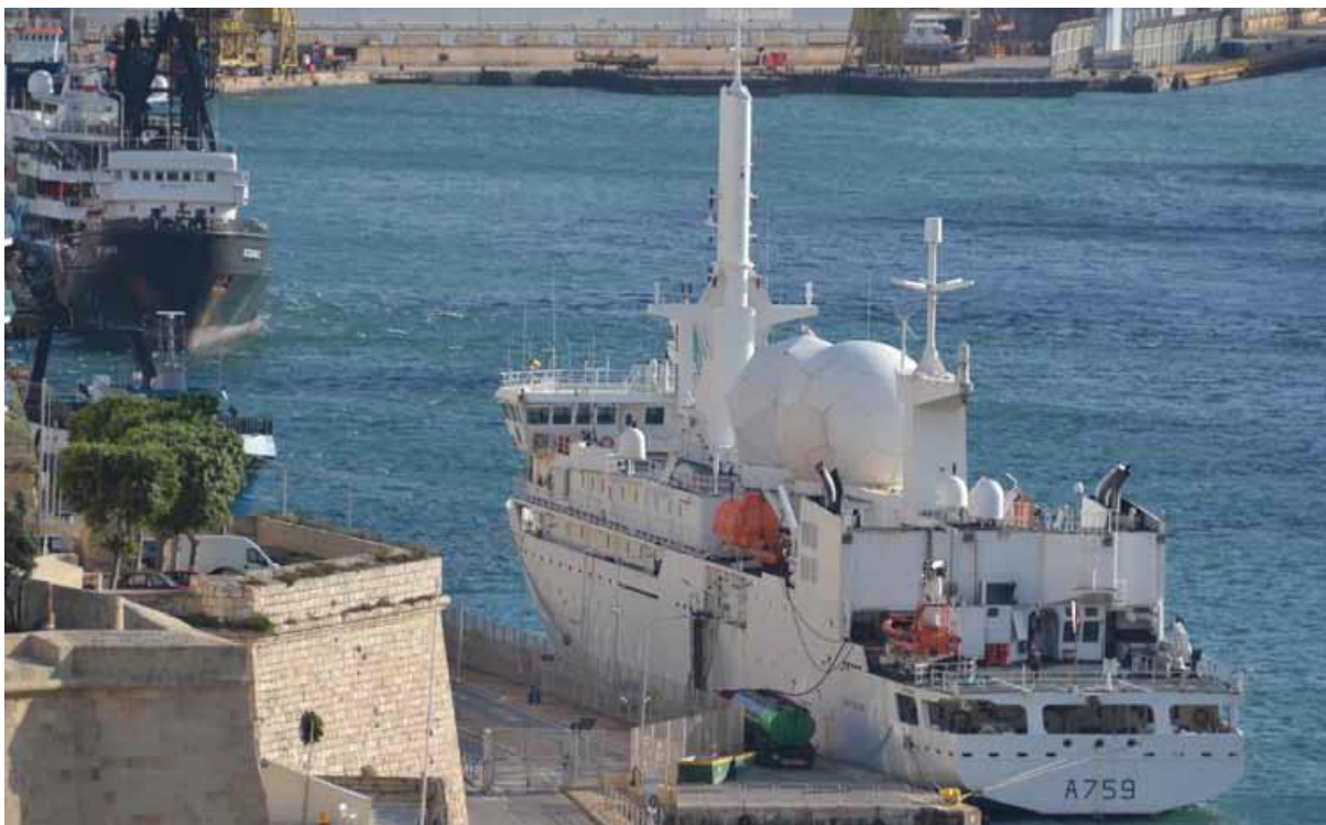
The A 759 Deputy De Lome visited Malta