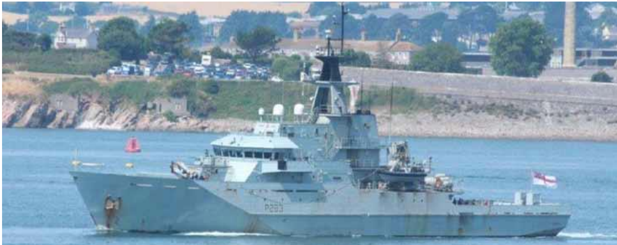
The Royal Navy's patrol ship HMS Mersey has been sent to the English Channel to help control the boats bringing migrants out of France.