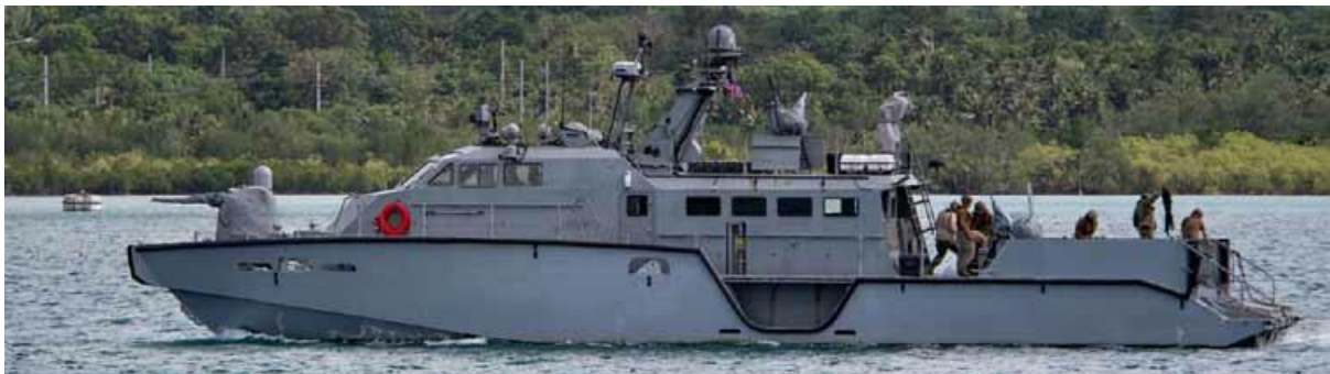
Two US Navy Mark VI patrol boats from Coastal Riverine Group 1's Guam detachment recently completed a 500 nautical mile transit - the longest these boats have made in the Pacific - testing endurance and operational reach