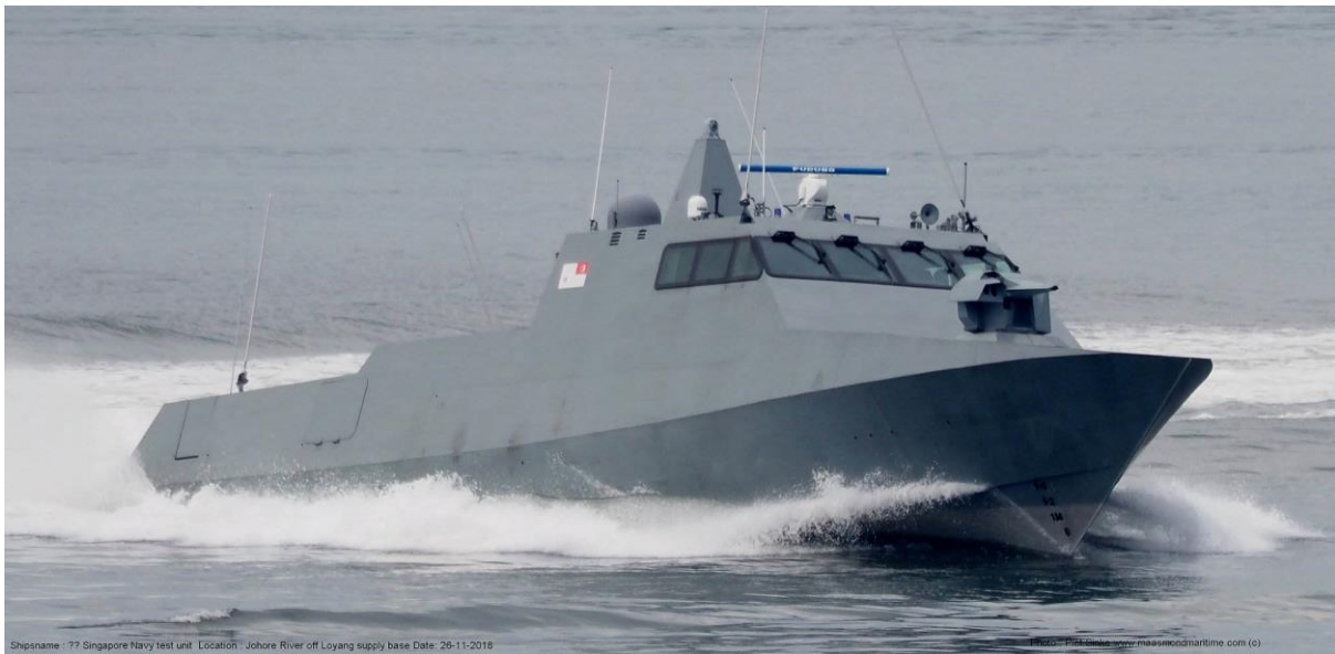
Shipname : 73 Singapore Navy test unit Location : Johore River off Loyang supply base Date: 26-11-2018

Spotted in the Johore Straits off Loyang Supply base a navy vessel without any further markings then the Singapore Navy flag painted on conducting tests