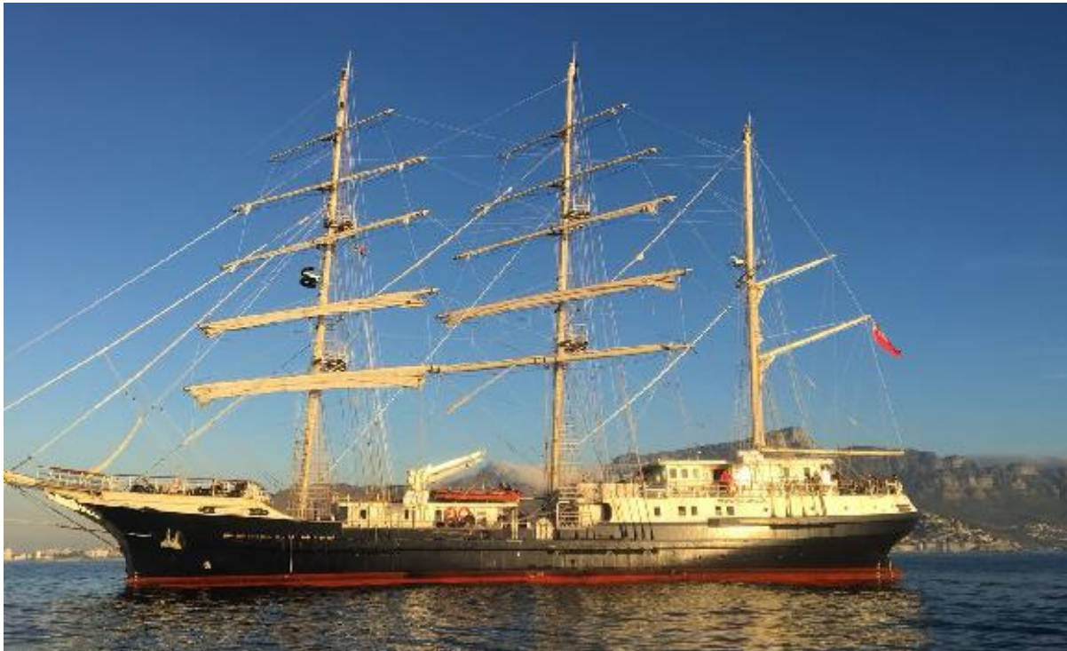
The British sail training barque Tenacious arrived in Table Bay on Wednesday 4 April. Angel comments: She is a modern wooden sail training ship, specially designed in the 1990s to accommodate anyone over 16 with a disability. When completed in 2000, it was the largest wooden ship to be built in the UK for over 100 years. She belongs to the Jubilee Sailing Trust (JST) and, along with the STS Lord Nelson, the pair are the only tall ships in the world that are wheelchair accessible throughout.

failure. Although ubiquitous and a seemingly critical part of what we do both ashore and afloat, it is equally critical to recognize when our GPS systems are not working properly and start mitigating the resultant risk. Source: MarEx