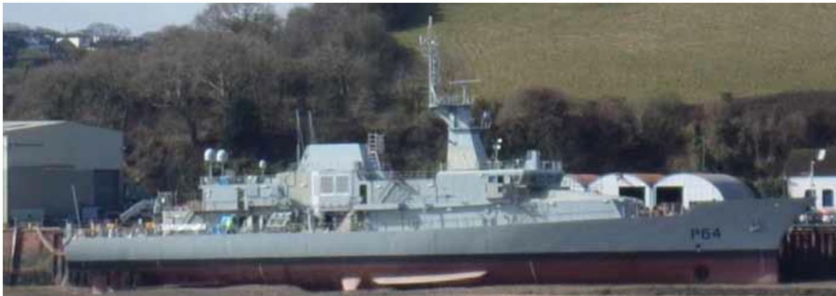
The LE George Bernard Shaw fitting out