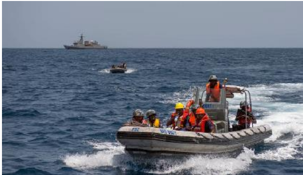
Members of the Nigerian navy approach HMCS Kingston.