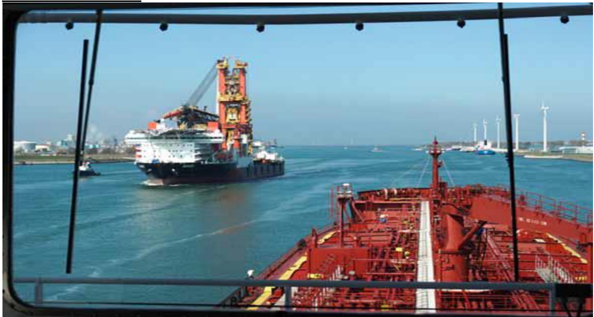
Heerema's Aegir inbound at Rotterdam-Europoort – Caland Canal