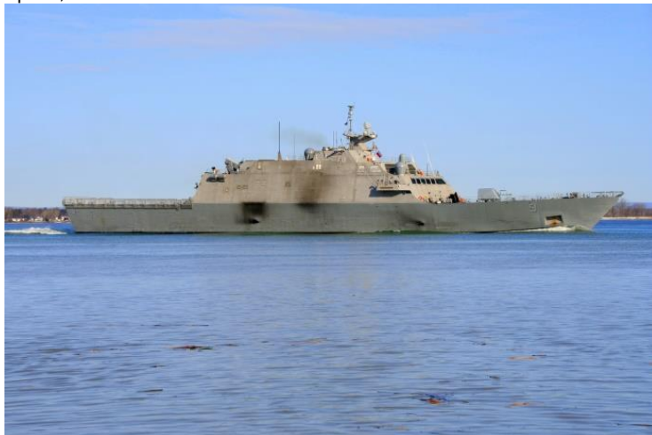
USS Little Rock transiting the St. Lawrence Seaway on March 31, 2018.

The Navy warship that was stuck on the St. Lawrence River for three months is now underway to its homeport at Naval Station Mayport, Fla., a Navy official told USNI News