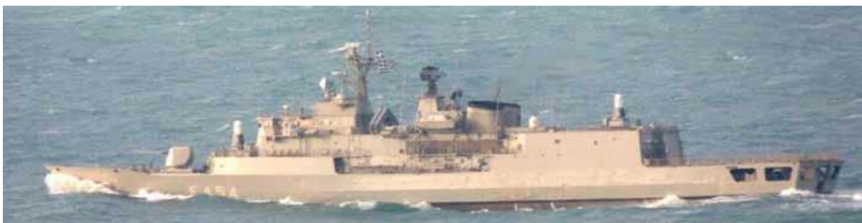
Greek frigate Psara (F-454) Departed 29-03-2018 from Haifa