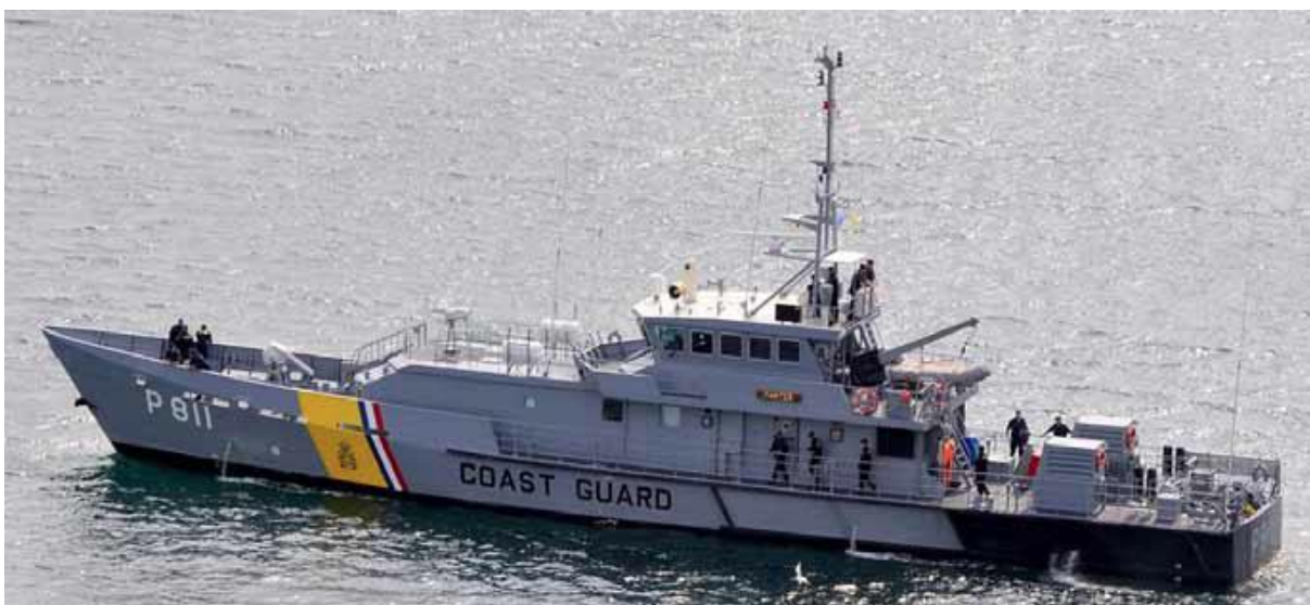
The Coast Guard Cutter P 811 Panter in Willemstad –Curacao