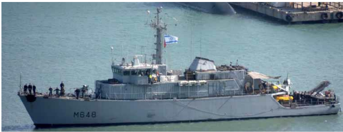
M 648 Lyre a Tripartite-class minehunter of the French Navy visited Haifa