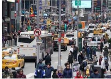
In New York City, some 1,200 hospital made available to coronavirus patients without interfering with anyone else's medical care, Mayor