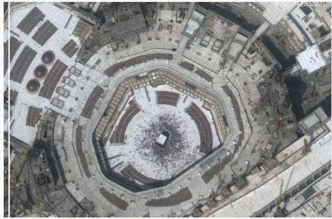
Photo: Great Mosque and Kaaba, Mecca on Feb 14, 2020 (Supplied: Maxar Technologies)

Photo: Great Mosque and Kaaba, Mecca on March 3, 2020 (Supplied: Maxar Technologies)