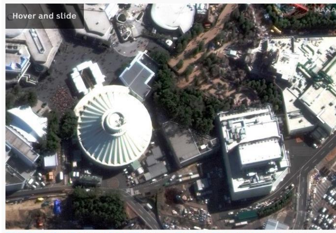
Photo: Crowds at Tokyo Disneyland on Feb 1, 2020. (Supplied: Photo: Tokyo Disneyland on Mar 1, 2020. (Supplied: Maxar Technologies) Maxar Technologie