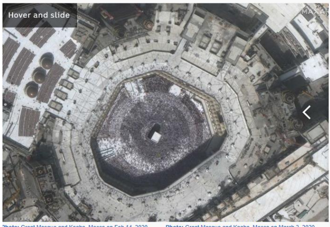
Photo: Great Mosque and Kaaba, Mecca on Feb 14, 2020 Supplied: Maxar Technologies)

The Great Mosque and Kaaba in Mecca, Saudi Arabia