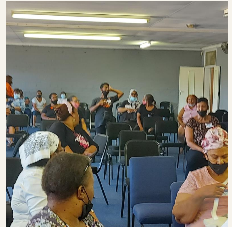
Bishop Lavis Community