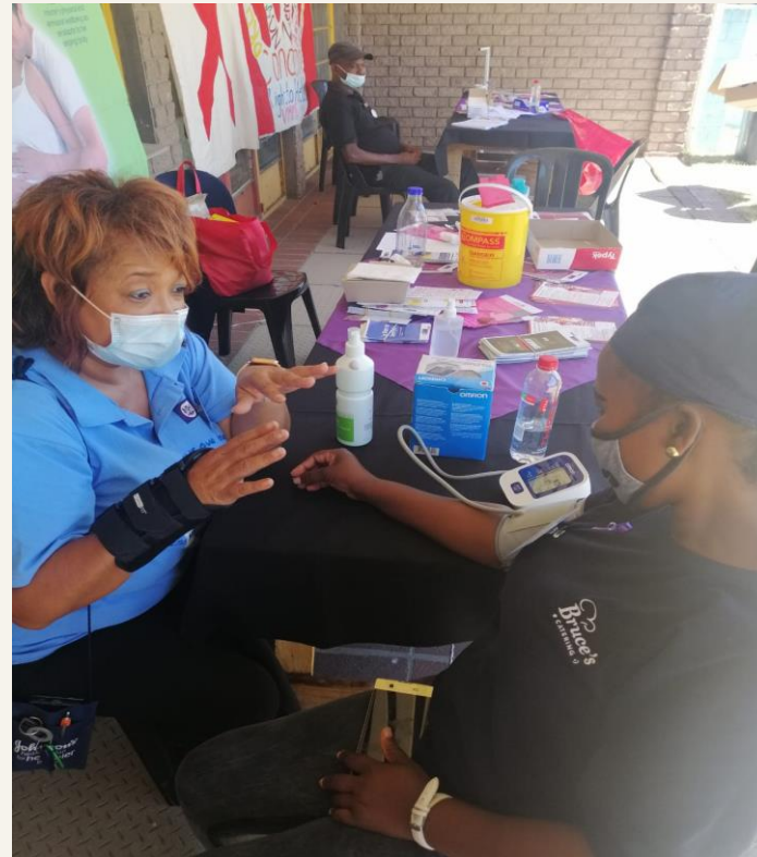
Bishop Lavis Community Health Centre

Blood sugar, cholesterol, blood pressure as well as weight status and waist circum to help individuals to understand their risk for CVD.