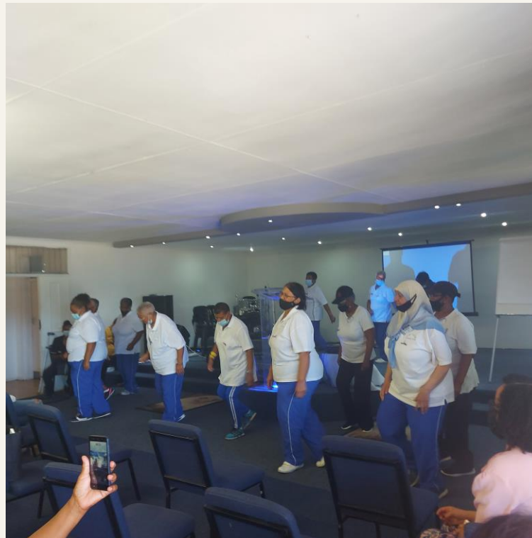
Step touch fitness club (local senior club)