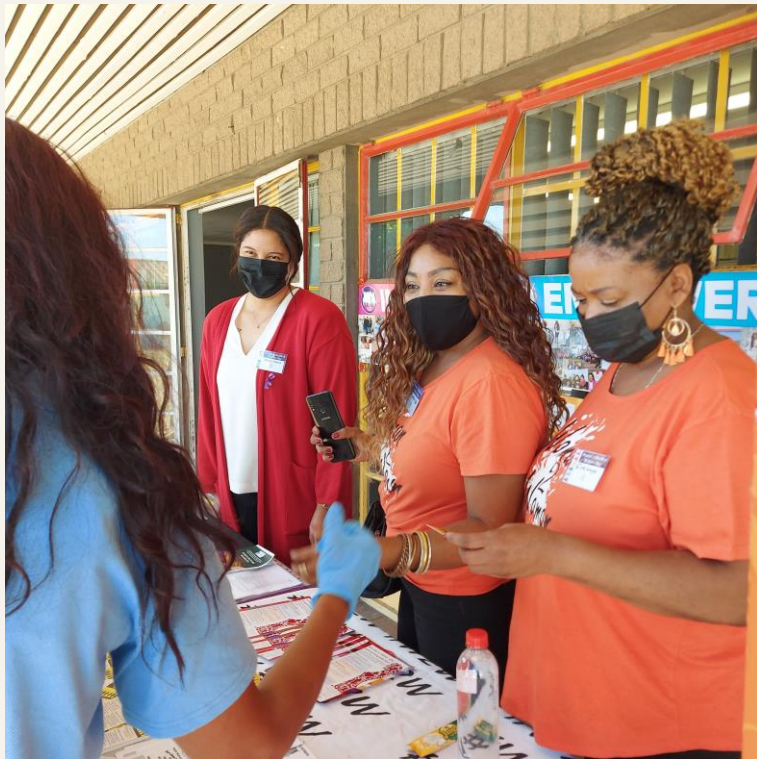
Woman2Woman (Local Non-profit Organization)