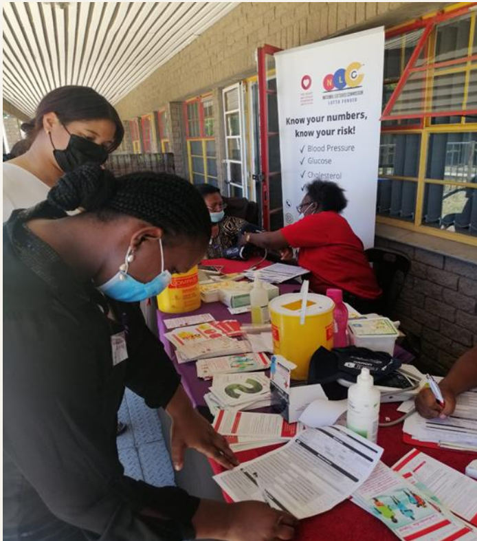
The Heart and Stroke Foundation

Provide information, tools and support to build healthy communities