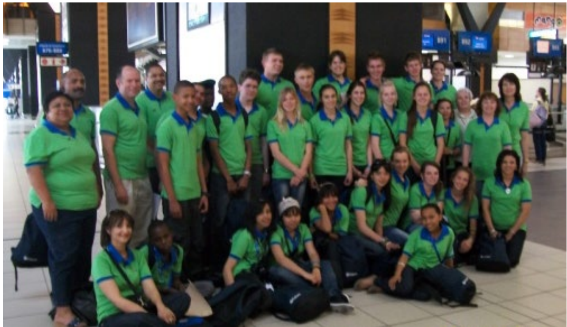
Our national team