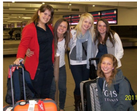
Flying for the first time!