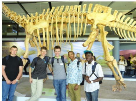
Iziko Museum, CT