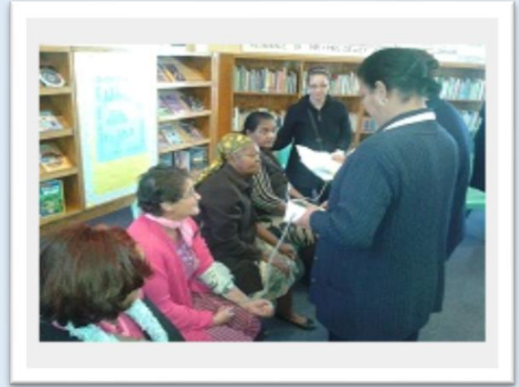
World Vision supplies free health services