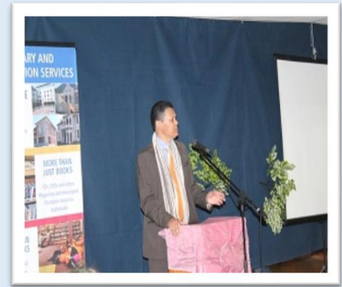
ATR chairperson welcomes all