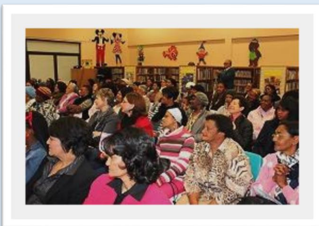
A Big crowd attended Women's Day celebrations in Atlantis