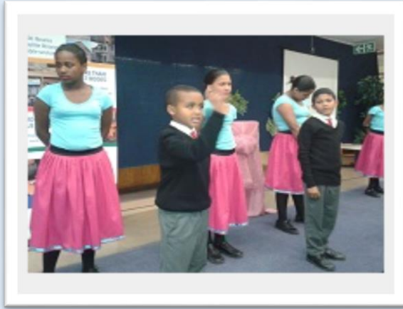
Parkview Primary learners during their performance of the Sharpeville drama