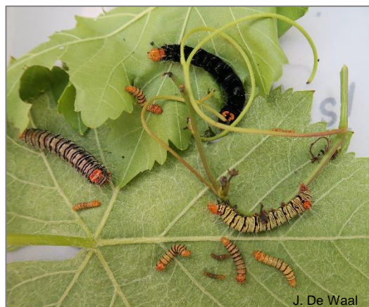
J. De Waal

When first hatched, creamy-white in colour. Later instars have bright black and yellow transverse bands along the thorax and abdomen. Head and hump at abdominal end of body are both orange. Long pale hairs emerge from all over body. Late instar caterpillars may also be predominantly black.