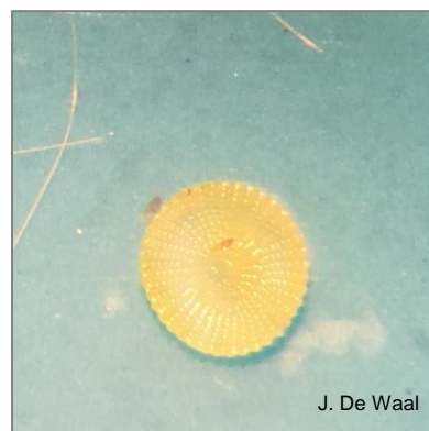
J. De Waal

When first laid, eggs are yellow but become cream-coloured with brown markings as they mature. Laid singly on the leaves of grapevines.