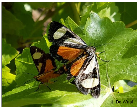
J. De Waal

Forewings greyish-black with a cream-coloured oval patch near the tip and a triangular cream patch near the base. Hind wings yellow to orange with a black band along the margin. Abdomen orange with a black stripe along the center line.