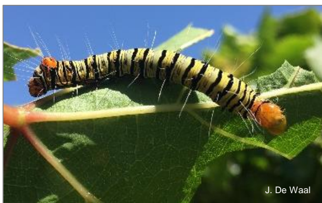
Trimen's false tiger moth, Agoma trimenii , larva.

To date (Oct 2017), no insecticides are registered against Trimen's false tiger moth, no natural enemies have been identified and no integrated control measures have been developed. This pest requires a great amount of research into its biology and control.