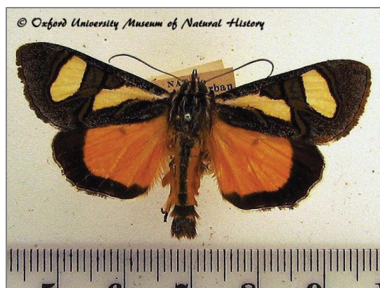
Trimen's false tiger moth, Agoma trimenii , adult.