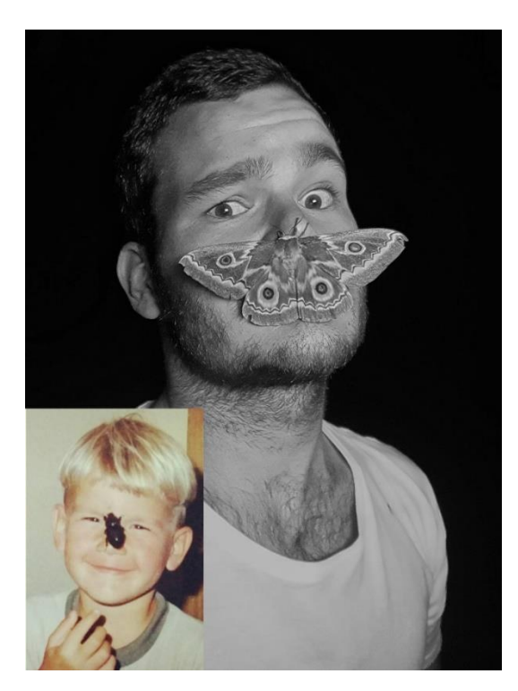
Me at the age of four with a female rhino beetle ( Oryctes boas ) and at 24 with a female zig-zag emperor moth ( Gonimbrasia

I don't know where my passion for insects came from. It was just there, since I can remember! And it's really challenging to prioritize and focus on "more important" things with such an intense passion lurking in your subconscious. I grew up in Kraaifontein, a suburb of Cape Town in the Western Cape. I never had a dull moment, because we are surrounded with insects and other arthropods regardless of where we are. I've spent every break (yes, every single one!) at school searching for insects and other interesting arthropods. I couldn't wait to finish my lunch so that I can use my lunch box for catching insects. In class, all I could think of is where to explore next in my next break or after school. On my way home from school, I would sneak into peoples' gardens with the hope to find something new or different. The more places I could explore, the better! Needless to say- I've been chased away so many times! Can you imagine a random small kid flipping rocks and logs in your garden? By that time, I knew exactly which insects I can find in our backyard, what they're eating and where to find them. I am very grateful that my parents always encouraged me to learn more about my passion by buying me books. At the age of nine, we moved to a smallholding near Klawer (between Clanwilliam and Vredendal). I spent the rest of my school career in a hostel in Clanwilliam. I went to an agricultural school where