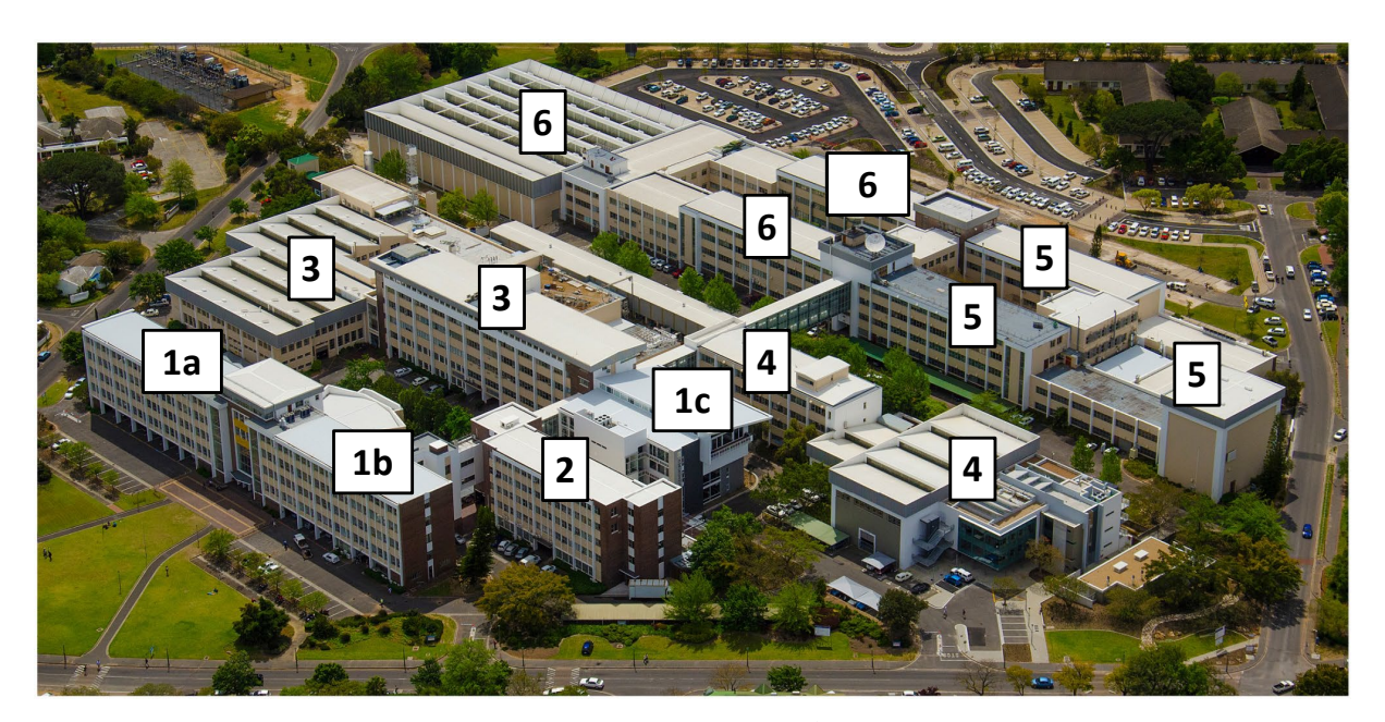
Figure 1.1: The building complex of the Faculty of Engineering (the numbers are used in the descriptions below).

The current building complex in Banghoek Road, Stellenbosch, was completed in the seventies and since then it has been expanded from time to time; for example, when the Knowledge Centre was added in 2012. The figure below shows an aerial photograph of the building complex.