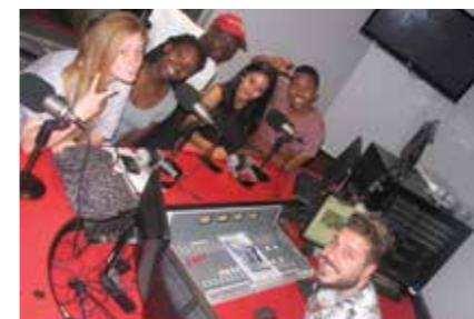
Leerders in die MFM-ateljee.

Leerders van die Stellenbosch-gemeenskap het onlangs die geleentheid gehad om meer te leer oor die mediabedryf tydens 'n week lange opleidingsessie wat deur die US se kampusradiostasie, MFM, aangebied is.