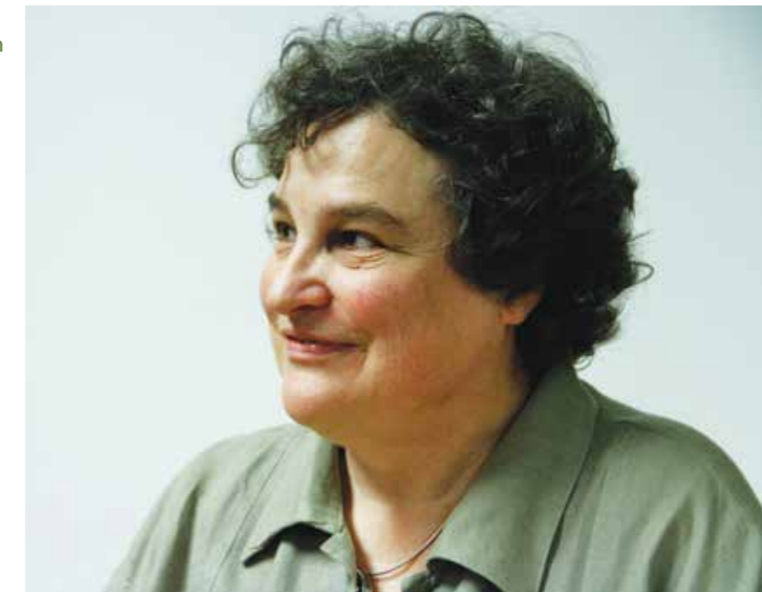
Prof Marlene van Niekerk

Dit plaas ekstra druk op jou, sowel wat die inhoud en die vorm betref van wat jy skryf, asook wat betref jou omgang met die oukatoriële keuses en mag wat jy het deur jou toegang tot uitgewers en markte. 'n Mens moet goed oplet wat jy doen, en 'n mens moet weet dat wat ook al jy doen, jy van links en regs en noordoos aangeval sal word. Ek weet nie of dit altyd gesond is vir 'n sogenaamde "kunstenaar" om in so 'n hewig gekontesteerde omgewing te probeer werk nie. Al wat ek langsaamhand begin glo, is dat hoe meer uiteenlopende en ideologies-verskillend georiënteerde mense ongemaklik of kwaad raak weens wat ek skryf, hoe beter. Die vorige minister van kuns en kultuur het 'n beroep gedoen vir die vestiging van sosiale kohesie deur middel van kunswerke.