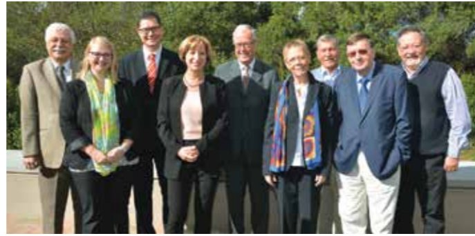
Die TRU-navorsingspan by die bekendstelling.

demokrasie vergelykend te ondersoek, oor verskillende kulture heen, vanuit 'n ekonomiese, politieke en sosiale perspektief, met spesifieke fokus op Suid-Afrika, Suid-Korea, Chili, Pole, Turkye, Duitsland en Swede.