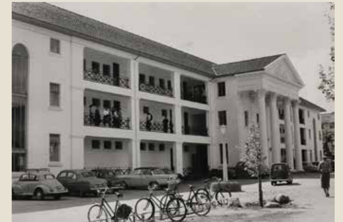
The Accountancy and Statistics Building was built in 1949.