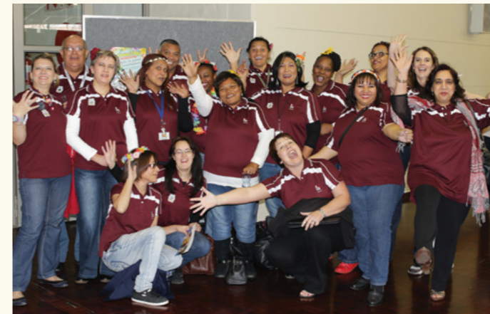
Die Sentrum vir Studentevoorigting en -ondersteuning (SSVO) het vanjaar die meeste Loslitdag-plakkers verkoop.