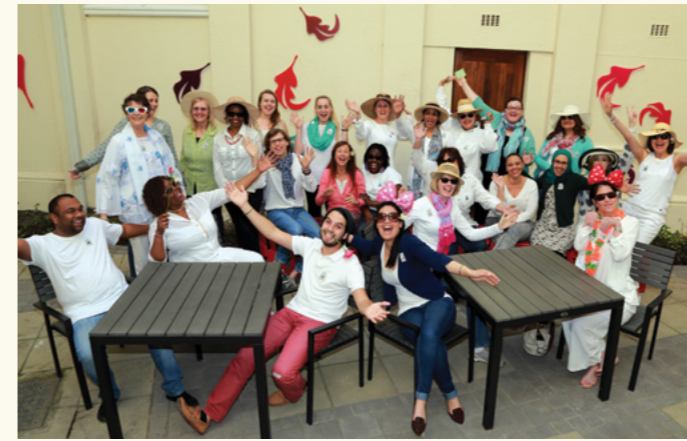
Personeel van die Nagraadse en Internasionale Kantoor wys hul kleurvolle uitrustings.

Besoek die Botaniese Tuin se webblad by www.sun.ac.za/botaniesetuin . Die databasis, IrisBG, se webblad kan besoek word by www.irisbg.com en die Tuinverkenner by http://sun.gardenexplorer.org .