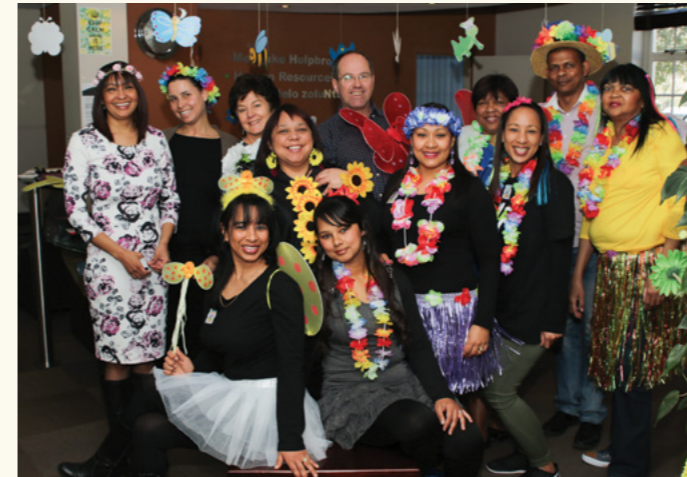
Die span van Menslike Hulpbronne het lente met hul uitrustings uitgebeeld.