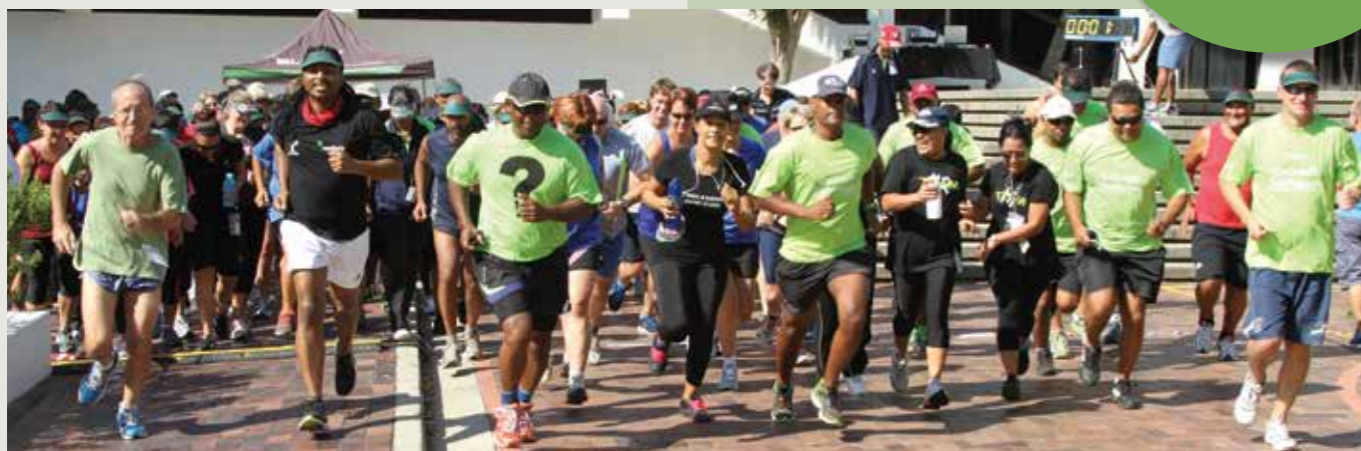
The 2014 Fun Run/Walk started at the SU Conservatoire.

Watch a video of the 2014 Fun Run/Walk at http://youtu.be/V-q176EIQzM .