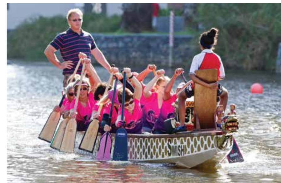
The amaBele Belles dragon boat racing team in action.

"At the time I joined in 2006, after I finished all my treatment, the Belles were the only breast cancer survivor dragon boat paddling team in Africa. Before that, I had never heard of dragon boating or thought of joining another team, of which there are quite a few in Cape Town," says Van Helden.