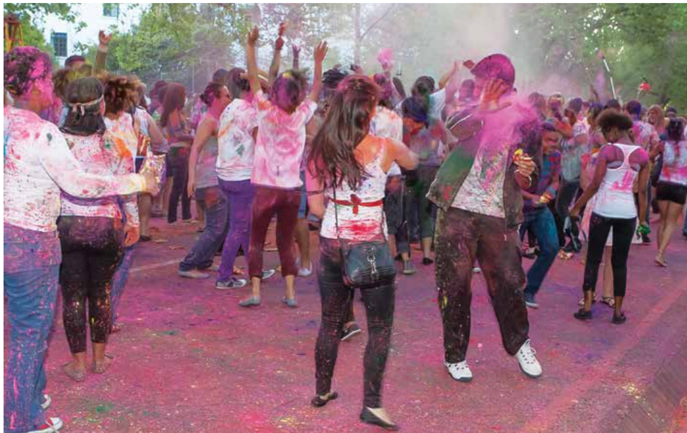
The University's week-long diversity celebrations came to an end on Friday, 4 October with the first-ever Festival of Colours held in Stellenbosch. Hundreds of Maties descended on Victoria Street to participate in this festival. Popular band Draadkar and MFM DJs were responsible for the festive atmosphere while students, lecturers and even a few children threw coloured powder at each other.