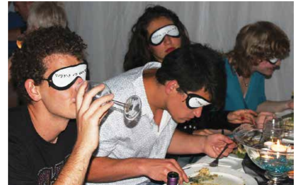
Dis-Maties se gaste by die Dinner in the Dark-ete het die uitdaging aangegryp om minstens hul hoofmaal geblinddoek te eet.

voorgesit, maar die kinkel in die kabel was dat gaste minstens die hoofgereg geblinddoek moes eet. Sommige het so ver gegaan as om al drie gange met die blinddoek aan te eet en dit het tot 'n paar interessante ervarings gelei.