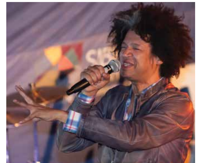
COMEDIANS PLAY RACE CARD: Two of South Africa's funniest men had SU students and staff in the palm of their hands during Diversity Week. Marc Lottering (pictured above) and Siv Ngesi drew full houses when they performed in the tent on the Rooiplein on respectively Wednesday, 2 October and Thursday, 3 October. Both made jokes about the diverse people of South Africa. Lottering joked about learner drivers, snobbish sales people in expensive boutiques and hair culture. Ngesi poked fun at the way black, coloured and white people act when they get out of the water, hair (yes, he too) and the way different cultures dance.

Watch a video of the Diversity Week celebrations on YouTube at http://youtu.be/XKojrFqELtw