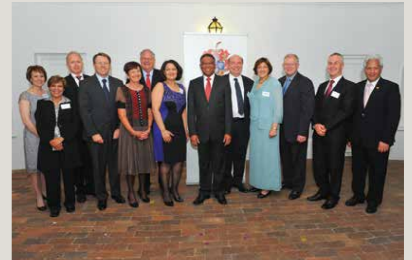
Stellenbosch University honoured these donors with Vice-Chancellor's Awards at a function held at The Courthouse in Sandhurst, Johannesburg.

SU. The academic excellence of a university is of utmost importance, as well as the preparation of the students for their future role in the workplace and community. In my life SU has played a particularly important role in this regard."