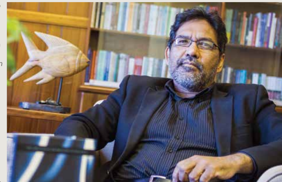
Prof Yusef Waghid

In addition, a special issue of the academic journal Studies in Philosophy and Education related to Islamic education and the challenges and opportunities in a postmodern world is due to be released in January. This edition of the journal will also be published as a monograph.