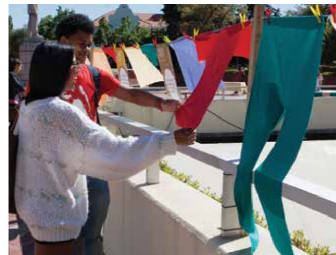
DIRTY LAUNDRY: Maties could publicly air their dirty laundry on the Rooiplein. Washing lines with paper "clothing" were erected on which Maties could write their experiences of discrimination.

Quite honestly, I do not think we really know who this group of people is or what their frame of reference is. They experienced a whole new world from the day they were born, right through the new schooling system to a changed university landscape. It is important to get to know them and to understand what makes them tick. We are lucky that we have some of the best born-free minds in the country at Maties. We are proud that we are not just a knowledge provider, but that we also equip our students to flourish in the diverse context of our country and continent.