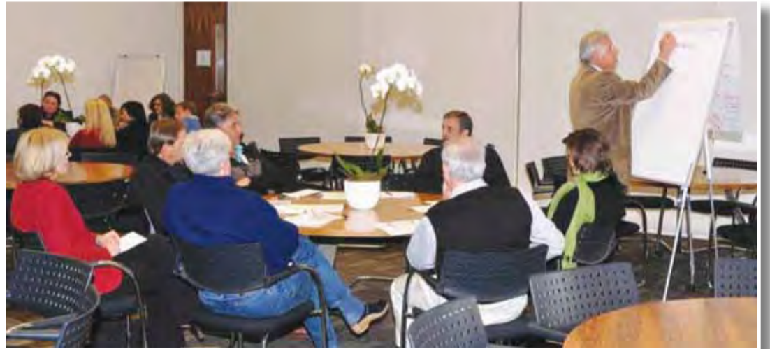
Gespreksgroepe druk aan't werk by die institusionele taaldag wat in September aan die US gehou is.

het op interessante wyse laat sien hoe die ideaal van meertaligheid op verskillende maniere uitgeleef kan word binne die onderrig-omgewing. Uiteraard het die diskussie ook die aandag gevra vir probleemareas en is 'n aantal behoorlik kritiese vrae gestel oor sake soos die haalbaarheid van meertaligheid, die vraag na dit wat studente werklik nodig het, koste, ensomeer. Maar dit was wel duidelik uit die aanbod dat daar werklik op verbeeldingryke en veral