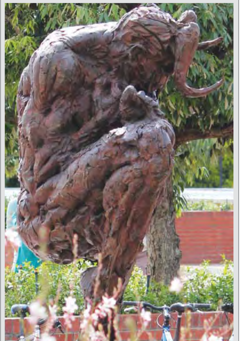
Dylan Lewis se Male Trans-Figure I op die Rooiplein.