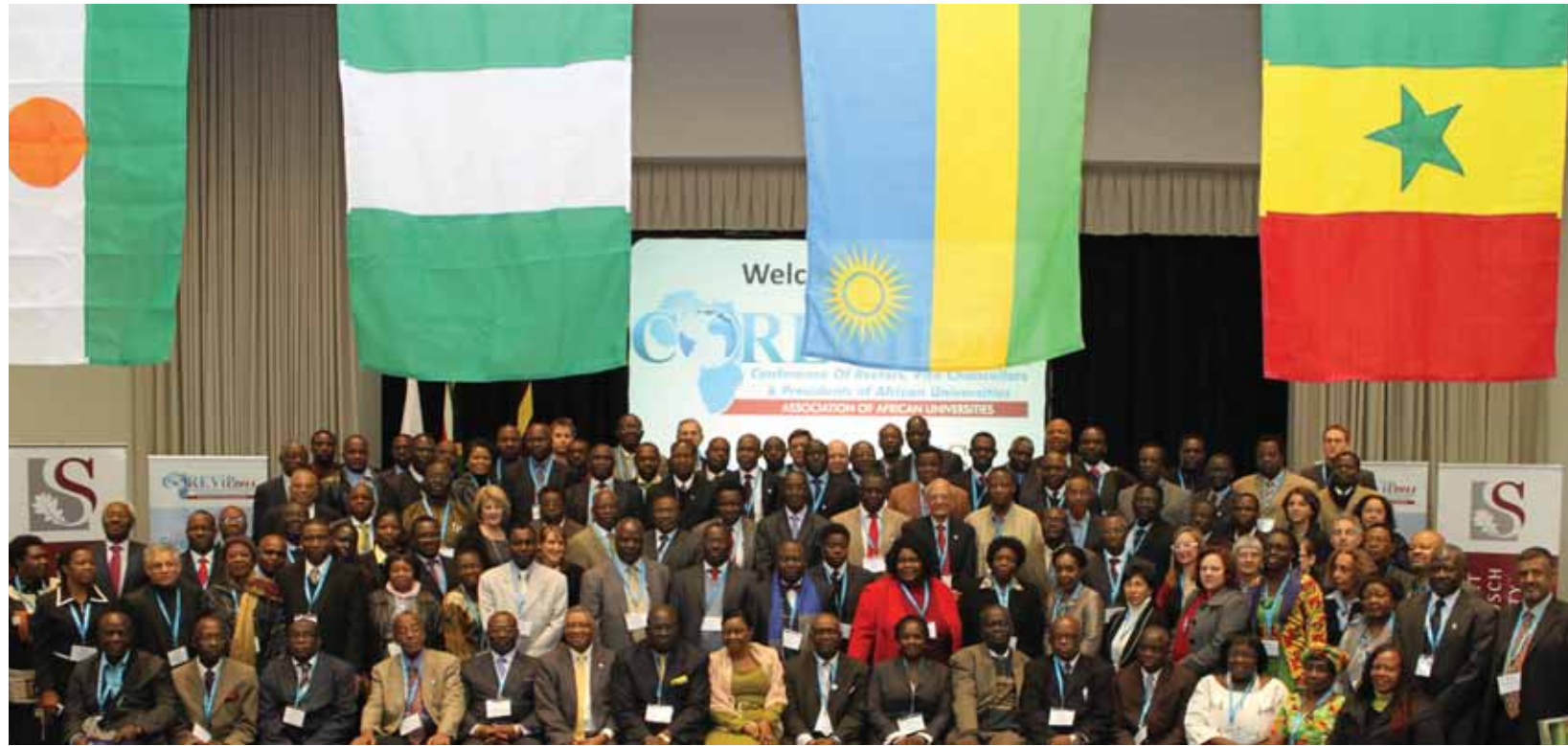
A colourful spectacle of African flags greeted the almost 200 heads of African universities who attended the bi-annual COREViP Conference of the Association of African Universities (AAU) at Spier from 30 May to 3 June.