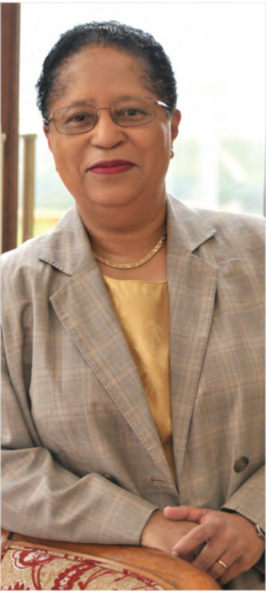
Dr Shirley Ann Jackson