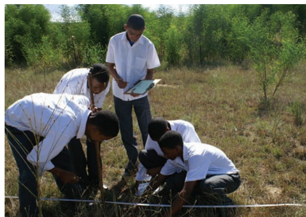
In 'n stuk versteurde fynbos rondom hulle skool stel leerders van die Sekondêre Skool Swellendam valle om miere vir die Imbovane -projek in te samel

"Deur hierdie skenking het RMB Imbovane in staat gestel om nie net