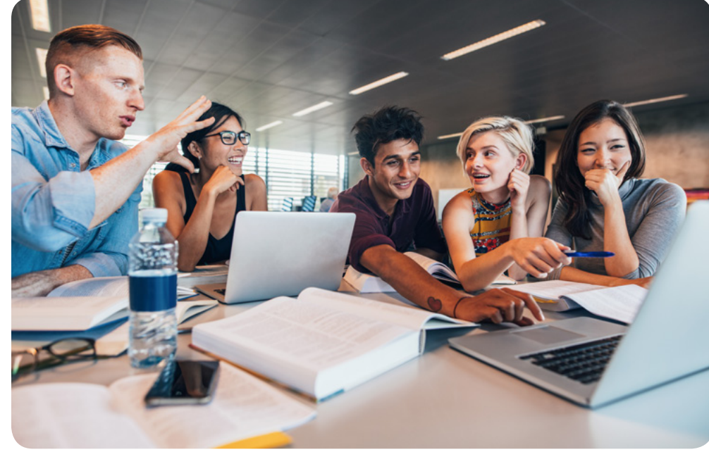
**Figure 2: Students working in groups

The students were engaged in various types of learning (Laurillard, 2012) while completing this learning activity. Firstly, they were prompted to investigate their case study documents and search for further information on them (inquiry). Secondly, they consolidated what they had learned by articulating their current conceptual understanding and how this is used in practice by building a video presentation (production). Thirdly, they also, at the same time, learned from each other while working in groups (collaboration). This was all done by using real-world case studies and the students were therefore engaged in authentic learning (Lombardi, 2007).