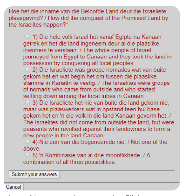
Figure 4: Screenshot of how a student sees the Clicker