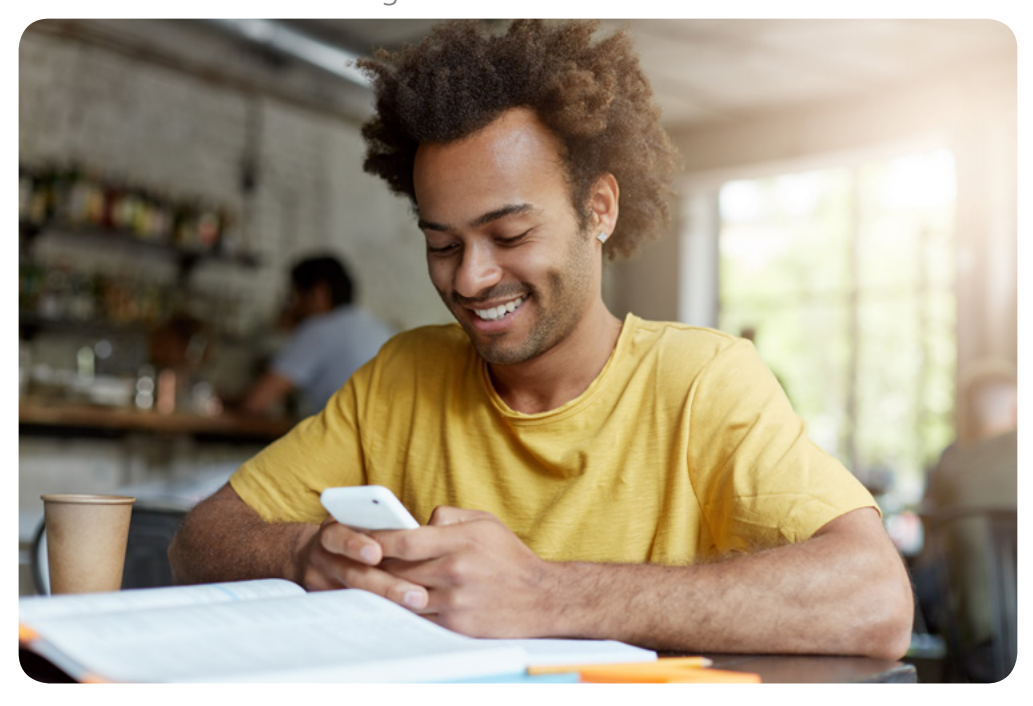
**Figure 1: Students completed a Clicker activity for attendance

the Clicker analysis was used as an attendance tool. This was done by linking the Clicker participants to their student numbers, allocating them a general attendance mark for participating in the activity and uploading the attendance mark to the SUNLearn gradebook. The attendance mark allocated was not related to the students' answers, either correct or incorrect, as this aspect of the activity was to ascertain their attendance and not their understanding.