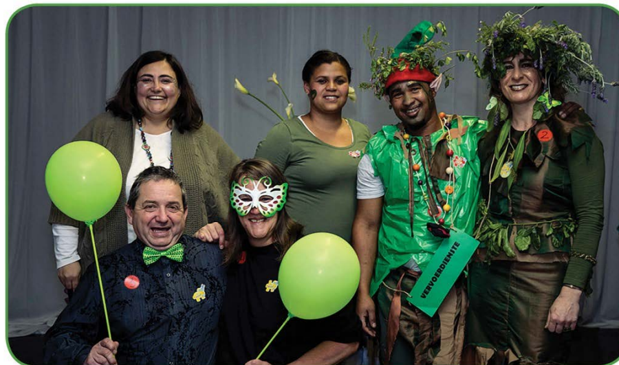
Casual Day 2017