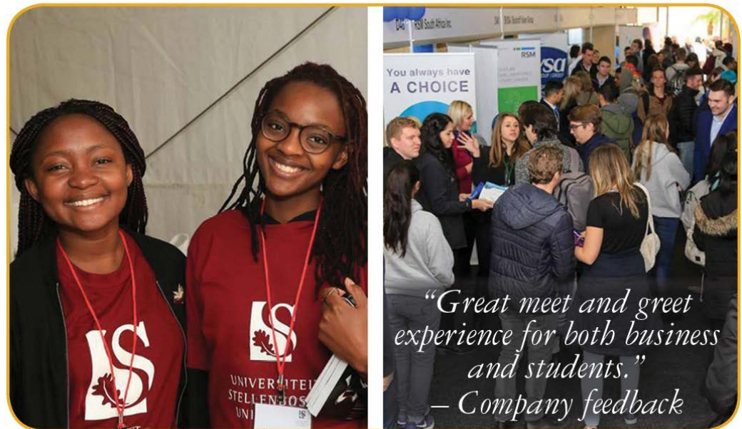
Career Fairs 2017