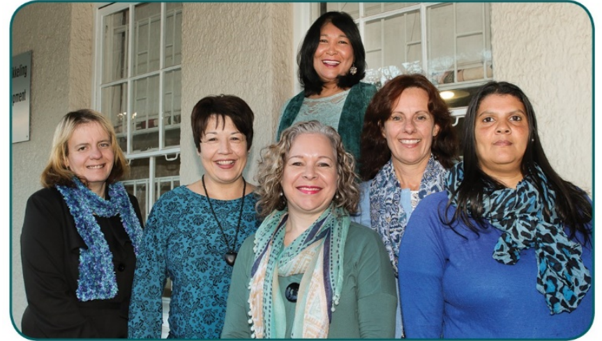
Direkteur se administratiewe ondersteuningspan / Director's administrative support team