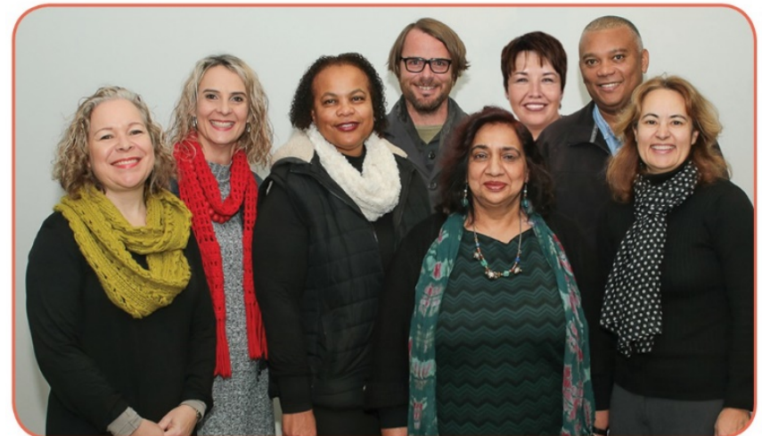
Bestuurskomitee / Management committee