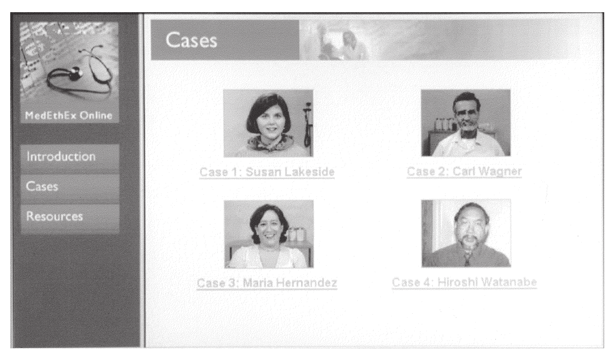
Figure 2. Introductory page with information, patient cases, and resources, all of which are available by clicking on the screen.