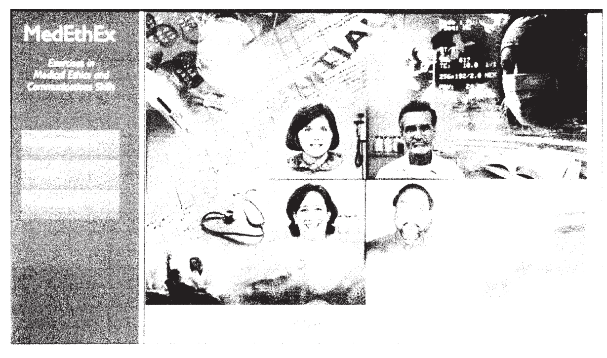
Figure 1. Opening screen of the program (http://griffin.mcphu.edu/medethex).