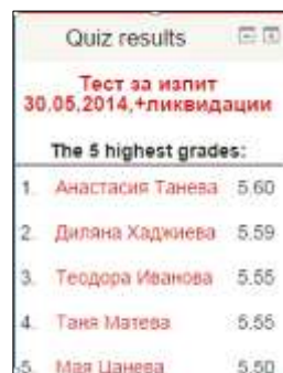
Figure 2. Quiz results (Moodle block).