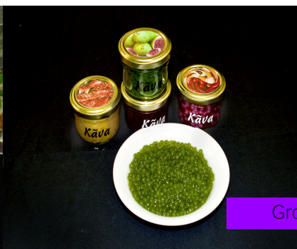
Groep 3: Kava