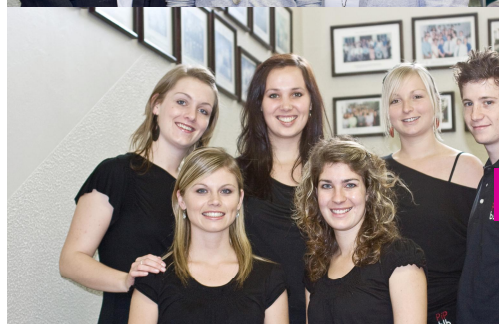
Groep 4: PiP