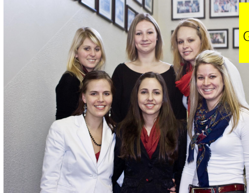
Groep 6: Pnam Bam