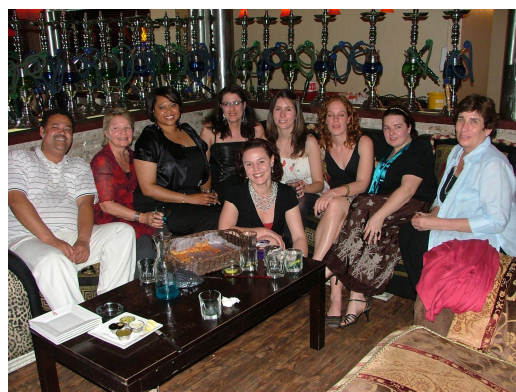
Personeellede & na-graadse studente by die finalejaarsafskeid @ Cubana

It is strange to be known so universally and yet be so lonely.—Albert Einstein