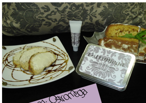
Groep 1: Ostromega