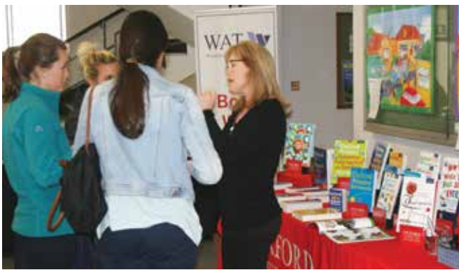
Die Fakulteit Opvoedkunde het op Donderdag 15 Oktober 'n woordeboekuitstalling aangebied om saam te val met Internasionale Woordeboekdag. Studente en personeel het die geleentheid gehad om rond te snuffel vir skoolwoordeboeke en vakwoordeboeke in vele tale, en om vrae aan die verteenwoordigers van verskillende uitgewers soos Pharos, Pearson, Oxford en Woordeboek van die Afrikaanse Taal (WAT) te stel. Noah Webster is op 16 Oktober gebore en Woordeboekdag word internasionaal ter ere van hierdie beroemde Amerikaanse woordeboekmaker gevier.