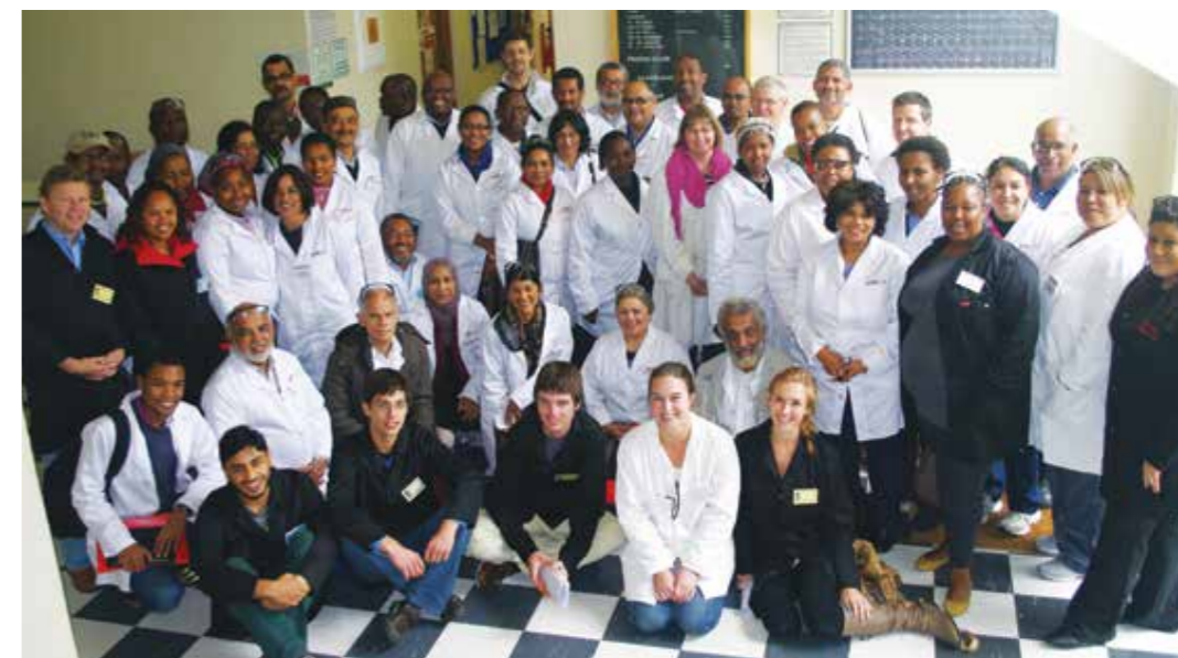
Even rainy weather and thunder storms could not keep the Metropole South District's teachers away from the SUNCOI Teachers' Workshop on 16 November 2013.

May 2013. Grade 11 learners from three disadvantaged Stellenbosch schools – Kylemore, Lückhoff and Cloetesville high schools – were invited to do their prescribed chemistry practical work at SU. The day was successful since the learners managed to link the theoretical concepts to the practical experiments. Learners expressed their excitement at being in a real chemistry laboratory for the first time, and said the lecturers had stimulated their interest in the subject.