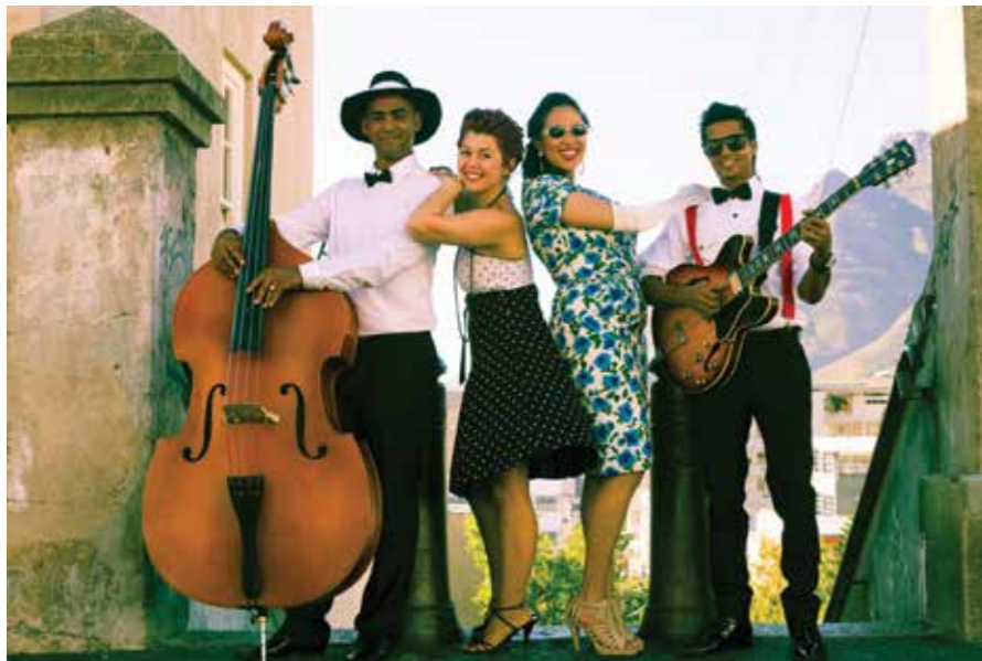
Die Jaloersbökkies tree op die US Woordfees op.

Vanjaar is die vyftiende US Woordfees se tema "Kuns hier, kultuur daar – siedaar, 15 jaar!"