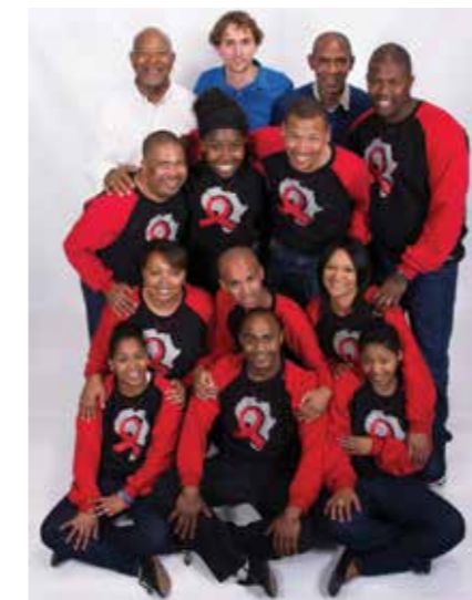
The creative team behind Lucky, the Hero!

An educational play about the importance of Aids testing that was created by Stellenbosch University's Africa Centre for HIV and Aids Management will be performed in America in June.