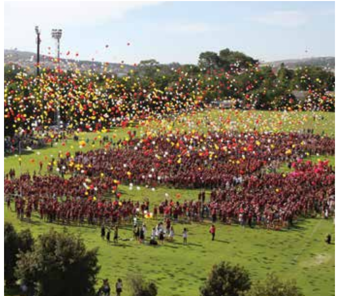
Die Matie-eerstejaars van 2014 het Donderdag 23 Januarie duisende bio-afbreekbare helium-ballonne by Coetzenburg-stadion die lug in gestuur – simbolies van die drome wat hulle vir hul toekoms het. Studente het hul drome op die ballonne geskryf en dit toe alles gelyk losgelaat. Van die drome wat dikwels voorgekom het, was om verlief te raak, voluit te leef, te groei in hul geloof en suksesvol in hul studies te wees.