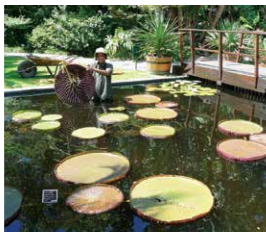
The water-lilies in the ponds of the SU Botanical Garden.

The first evening the Victoria flowers are white and have an extremely sweet smell, the second evening the flowers turn pink before it disappears