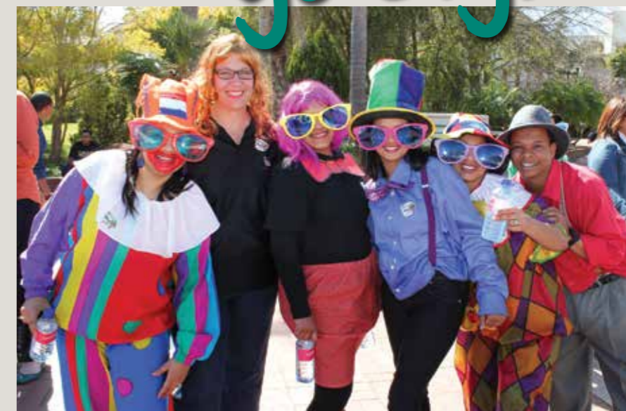
The team of the Division Human Resources with their colourful outfits that earned them the prize for the best dressed team.

All six team members had to arrive simultaneously at each building, amongst others Admin B and C, the Conservatoire and the Neelsie. They received their clue and then had to move on to the next building. An official accompanied them on their route, kept time and made sure they did not cheat.