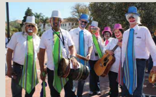
Staff of the Vehicle Pool in their bright and big outfits on Casual Day.

The team of the Department of Biochemistry completed the “Amazing Race” in the shortest time, while Irene women's residence and the Vehicle Pool were in second and third place respectively.