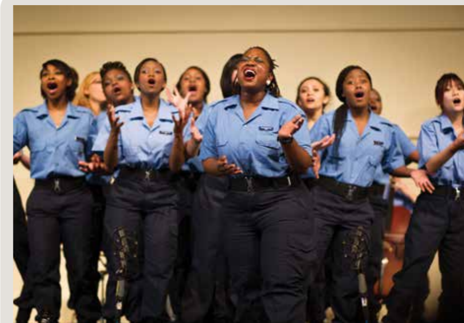
Hippokrates Ladies (above) won the national university Sér Ladies' Competition for the second time in a row on Saturday, 31 August. They also won prizes for the best prescribed song and best own composition. The competition was hosted by the North West University in Potchefstroom. Wilgenhof came second in all three categories – overall, best prescribed song and best own composition. The men's competition was won by Sonop from Pretoria.