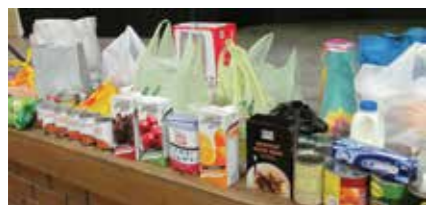
Die kos wat op die aand van Como se verjaardagpartytjie vir die Voedselbank ingesamel is.

Hy het op sy verjaardag op 28 Augustus (sy kroonverjaardag) 'n