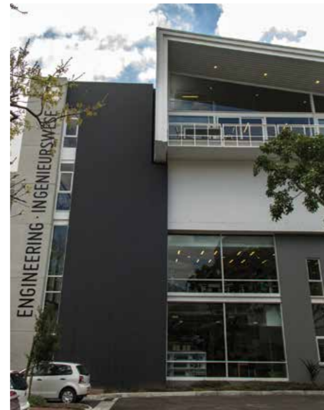
Die indrukwekkende Ingenieurs- en Bosboubiblioteek.

Twee nuwe geboue van die US se Fakulteit Ingenieurswese, die Kennisentrum en die Prosesingenieurswese-Anneks, is in September amptelik geopen – nog 'n voorbeeld van die US se toewyding om moderne en funksionele "groen" geboue op kampus op te rig.