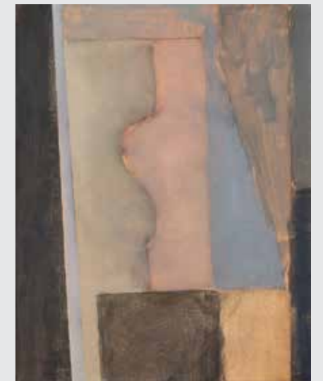
Still life with metronome – Homage to Matisse