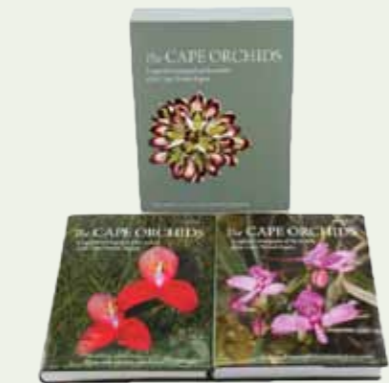
The two volumes (and book holder) of The Cape Orchids: A regional monograph of the orchids of the Cape Floristic Region .