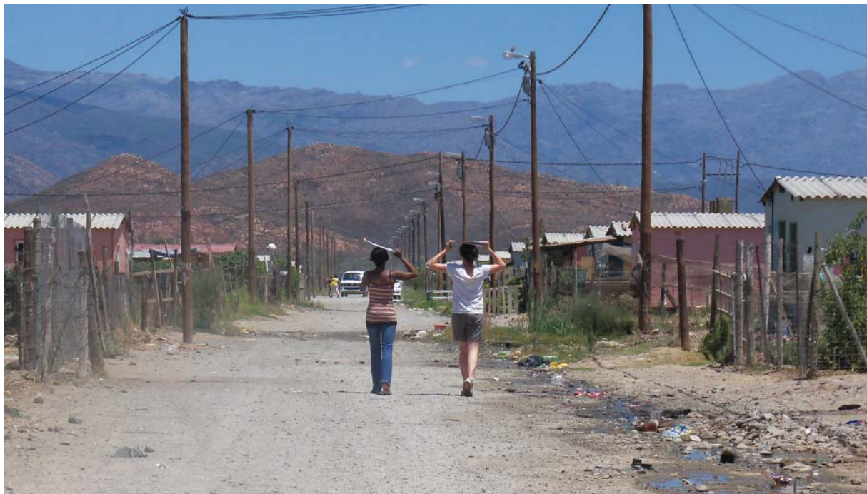
Not even the excruciating heat prevented the students and volunteers from walking door to door to complete a socio-economic survey in Avian Park in Worcester.

According to Vorster the results obtained from the Avian Park survey reflect not only the challenges faced