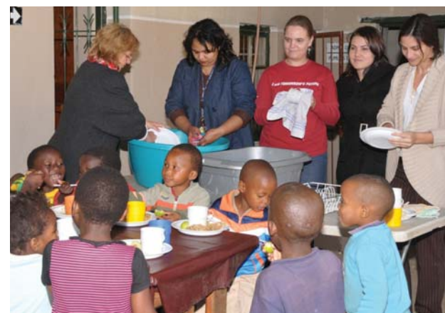
Staff members of the Division for Research Development spent Mandela Day at Kuyasa Horizon Empowerment in Kayamandi by assisting in their feeding scheme.