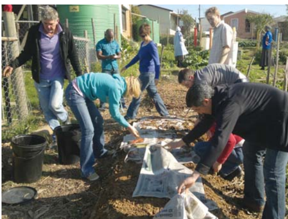
Hier help 'n groep personeellede van die Mpact Navorsingslaboratorium in die Departement Bosbou tuinmaak by die Kayamandi Legacy-sentrum.

Direkteur: Gemeenskapsinteraksie, meen personeellede kan boonop hul eie lewe verryk deur hul tyd en hulpbronne aan ander te gee.