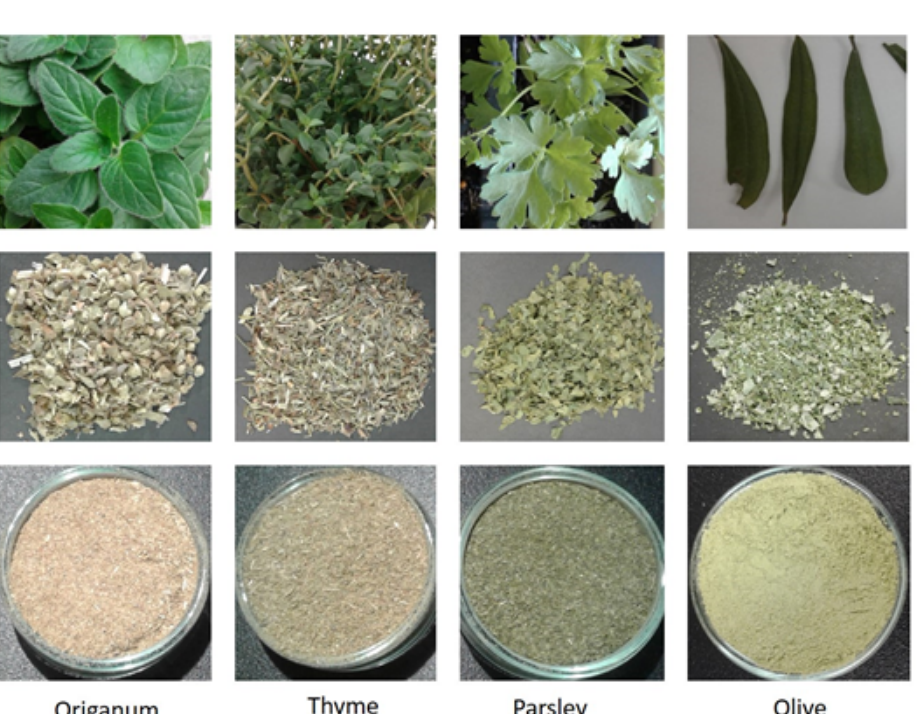
Origanum Origanum vulgare

Fresh leaves of oregano, thyme, parsley and olive have characteristics that make them recognizable. In a dried and ground state, it is more challenging to identify the products, although they still appear different. Finely ground material have few characteristic properties that can be related back to the original product.