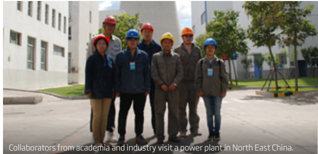
Collaborators from academia and industry visit a power plant in North East China.

The project improving the combustion mode and security running control strategy to decrease pollution in northeast China is a collaboration between Jilin University, the University of Nottingham and three Chinese energy companies. It aims to reduce air pollution by analysing power plant boiler combustion and air distribution and using this data to develop more energy-efficient processes. The collaboration has also supported student learning through supported workshops, seminars and mentoring between university and industrial collaborators.