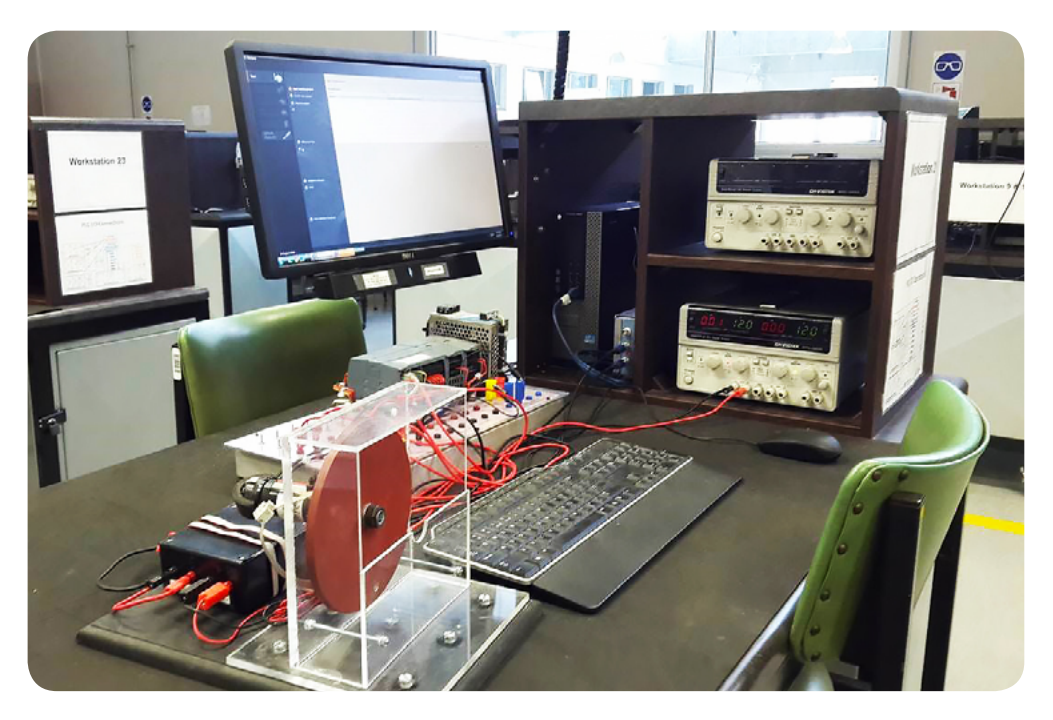
Figure 1: Equipment available at each workstation in the laboratory

The laboratory sessions are facilitated by a lecturer, who is assisted by a laboratory technician and a student assistant. Their responsibility covers the answering of questions related to both the hardware and the theory involved in the sessions.