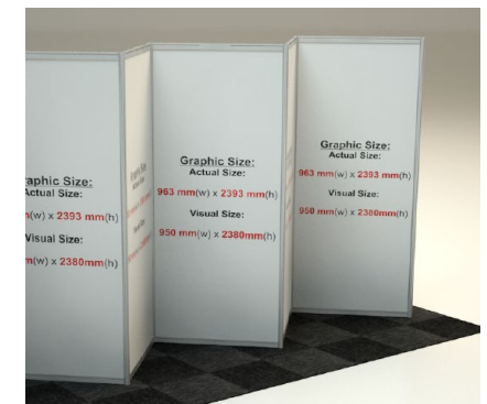
Sample of stand

T: 00 27 (0)21 808 2401 / E: asmadmin@sun.ac.za / tasneem@sun.ac.za / www.africansunmedia.co.za