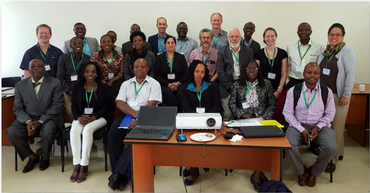
Group photo: Primafamed PCAT workshop attendees

B. Presentations will be available online soon on the Primafamed website