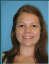
KA BUTTERFLY Intermediate & Senior Phase I 80.9%