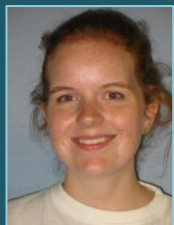
C ATMORE Intermediate & Senior Phase III 87.7%