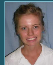
E THERON Foundation Phase II 85.0%